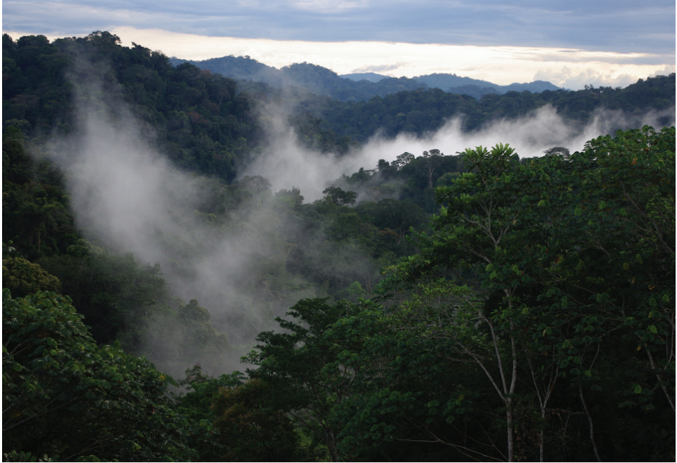
Figure 1. Monts de Cristal National Park, view from Tchimbélé.

visited by botanists and is one of the most densely botanically collected areas in Gabon (Wieringa and Sosef 2011). However, new species have been regularly described from the national park (e.g. Ječmenica et al. 2016; Stévant et al. 2014), including a new genus of Annonaceae, Sirdavidia (Couvreur et al. 2015) which was recently awarded the top 10 new species of 2016 (International Institute for Species Exploration 2016). Here, we describe two new species collected during a botanical trip to the Monts de Cristal National Park in June 2016, one Annonaceae and one rattan.