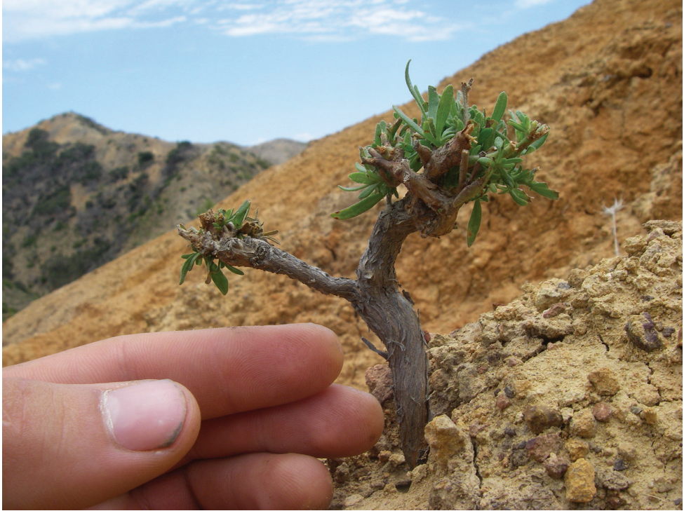
Figure 3. A severely browsed individual from a population not protected by exclosure fencing.

have likely obscured our understanding of some basic aspects of the natural history of this rare, native island-endemic plant.