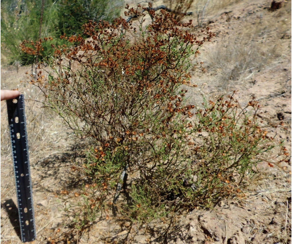
Figure 1. An individual from the current monitoring effort for Crocanthemum greenei . This particular individual, growing within an exclosure, had an initial stem measurement of 44 cm and is representative of size for non-browsed individuals.