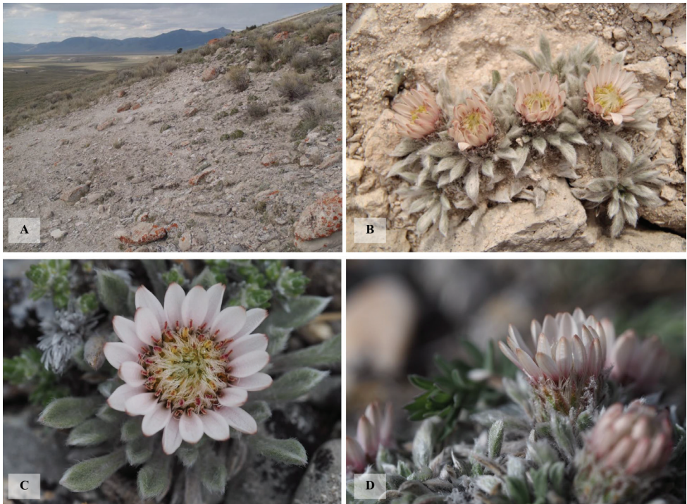
Figure 1. A habitat of the type locality of Townsendia lemhiensis B habit of Townsendia lemhiensis at the type locality C close-up of Townsendia lemhiensis capitulum D close-up of Townsendia lemhiensis phyllaries.

white slope, sparsely vegetated, soil derived from tuff conglomerates, in upper elevation (6968 ft) sagebrush steppe in intermontane valley; Björk 30772 (UBC V252326) 21 May 2013. USA, Idaho, Lemhi County, 18 Mile Wilderness Area, south of McFarland Road, 44.48000°N, 113.20333°W, on ashy white flats and slopes, sparsely vegetated, in upper elevation (6857 ft) sagebrush steppe in intermontane valley; Whitton 252 (UBC V252322) 13 May 2018. USA, Idaho, Lemhi County, 18 Mile Wilderness Area, 44.47293°N, 113.20670°W, on open hillside (7355 ft) with sparse sagebrush and antelope brush on grey-brown rocky substrate; Whitton 256 (UBC V252323) 14 May 2018. USA, Idaho, Lemhi County, 18 Mile Wilderness Area, 44.44530°N, 113.17541°W, on exposed rocky slope (7371 ft), in areas of grey-white substrate, with bunchgrass, and antelope brush.