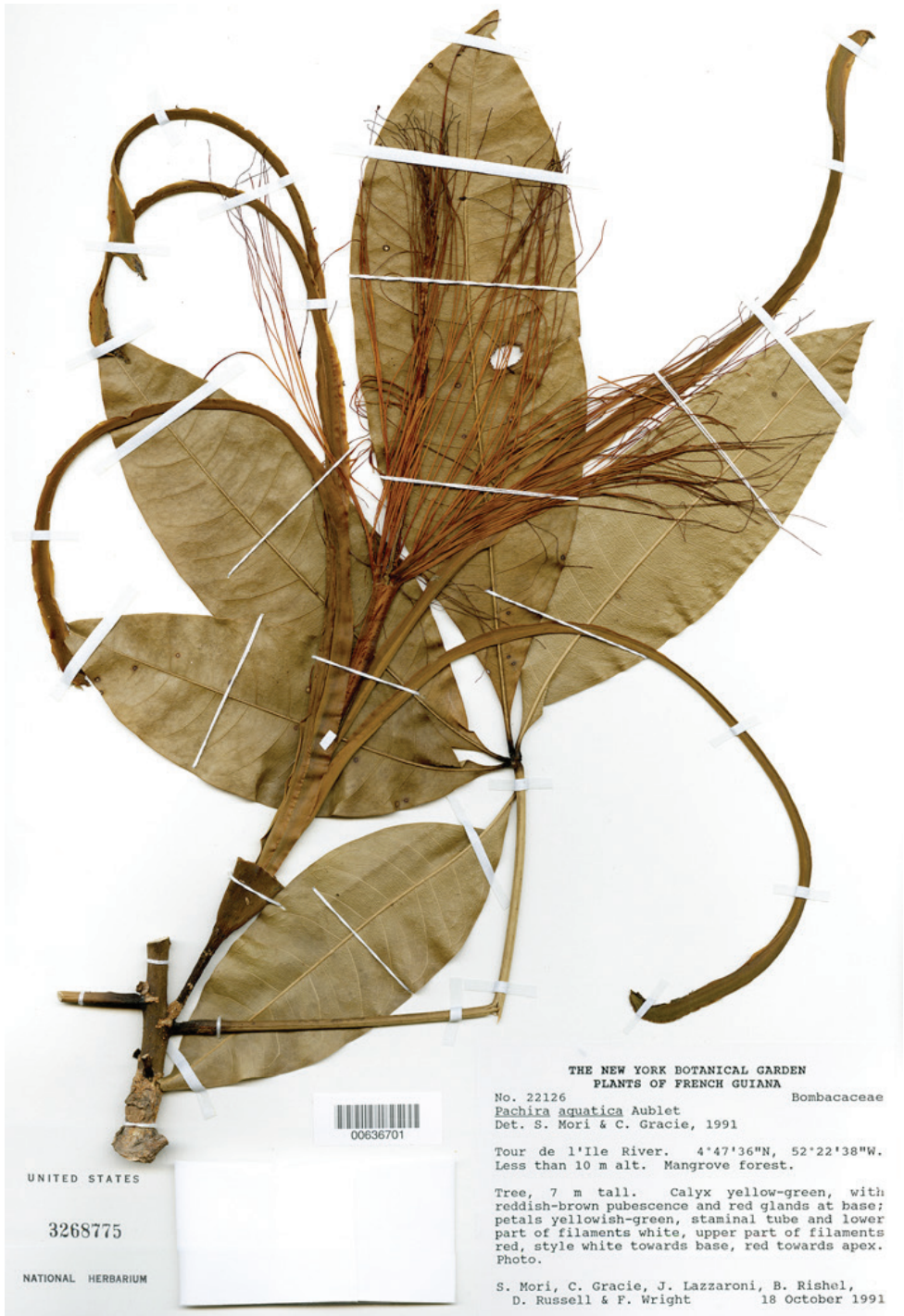
Figure 1. Epitype of Pachira aquatica Aubl. (US barcode 00636701).