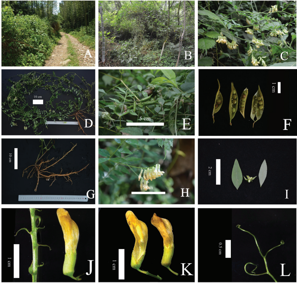
Figure 2. Vicia mingyueshanensis A, B habitat C habit D the whole plant E pods F pods and seeds G root H inflorescences I leaflets and stipules J bractlet K calyx L tendrils.

tions, this species is represented by no more than 200 large and mature individuals, along a road where bamboo was being cut. Due to its rarity and a low number of individuals, Vicia mingyueshanensis is considered to be Critically Endangered (CR, B1) , according to the IUCN (2019).