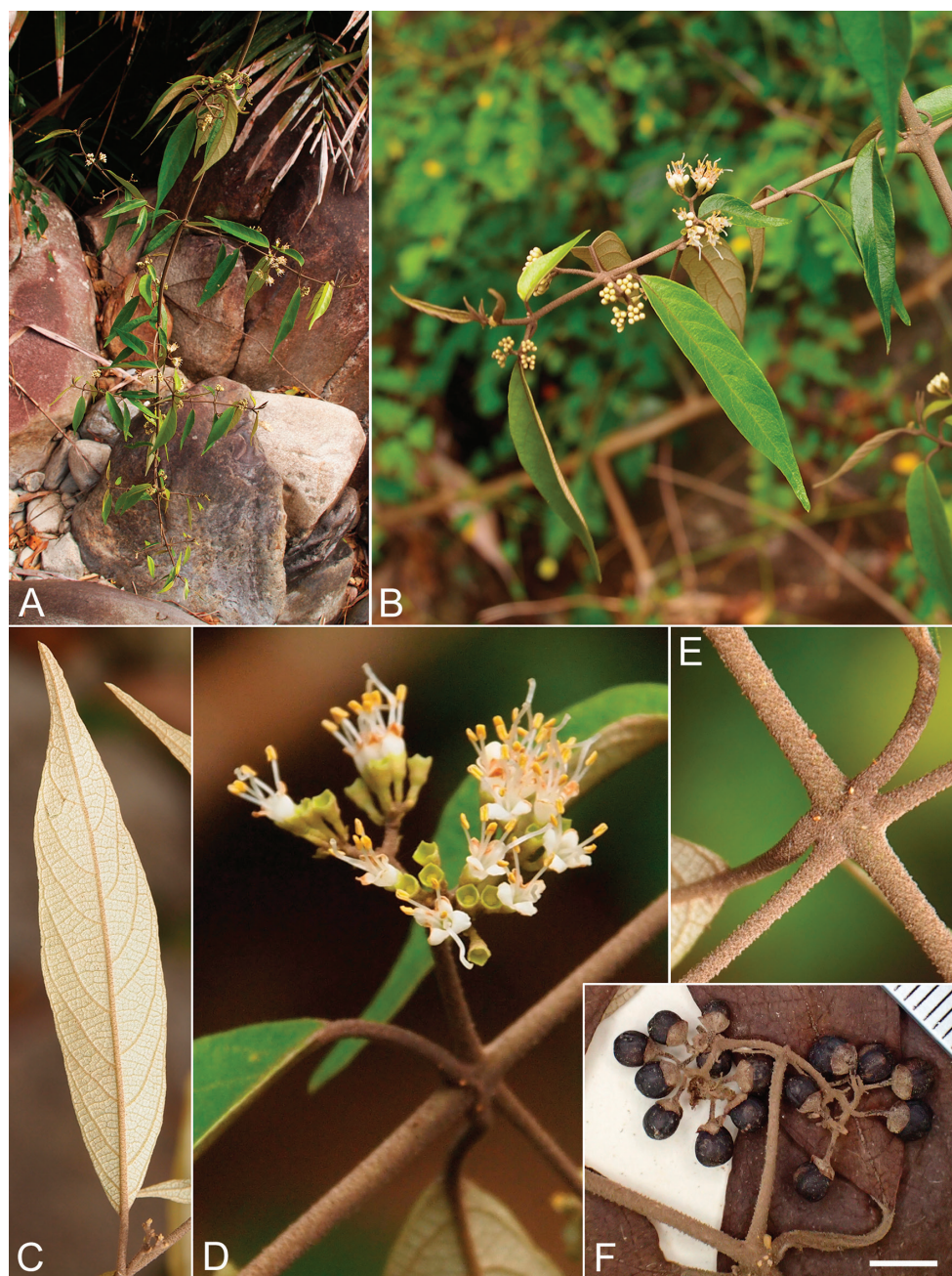
Figure 1. Callicarpa bachmaensis Soejima & Tagane, sp. nov. A Branch apex B Flowering branch C Abaxial surface of lamina D Inflorescences E Twigs and base of petiole, F Infructescence [ Binh & Cuong VN1985 (HN)]. Scale bar E = 5 mm).