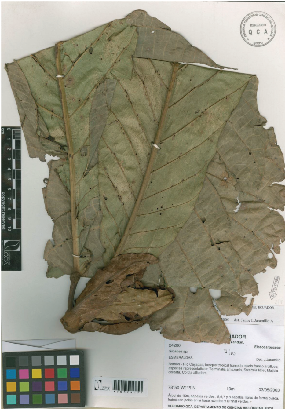
Figure 3. Sloanea cayapensis . Image from the holotype at QCA (J. Jaramillo 24200).

1.2–2.5 cm long, 1–2 cm wide, rounded, opening by 4 rigid valves; bristles 2.8–6 cm long, curled, contorted and flexible, laterally flattened, densely hirsute at the base, more sparse and appressed pubescence towards the apex, easily detached. Seeds not studied.