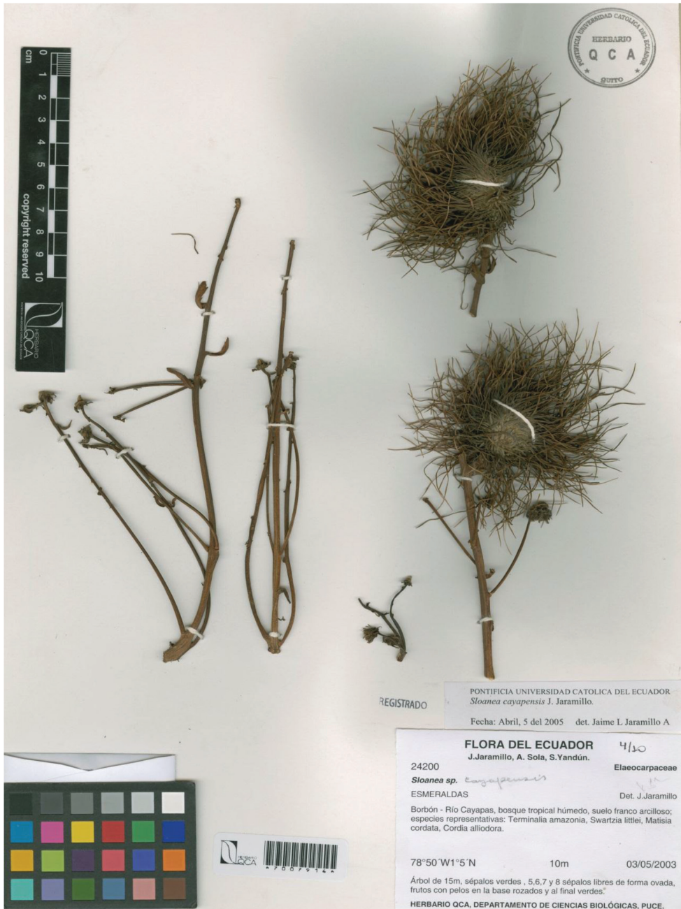
Figure 2. Sloanea cayapensis . Image from the holotype at QCA (J. Jaramillo 24200).

sacs, extended as an acute or obtuse awn, very short, up to 0.5 mm long; anther sacs not opening widely along entire length. Ovary 2–4 mm long, 1.5–2.7 wide, with four locules, 4-angled, ovoid, densely hirsute; placentation axillary; style to 8 mm long, densely hirsute at the base, becoming sparsely hirsute towards the apex. Fruits globose capsules