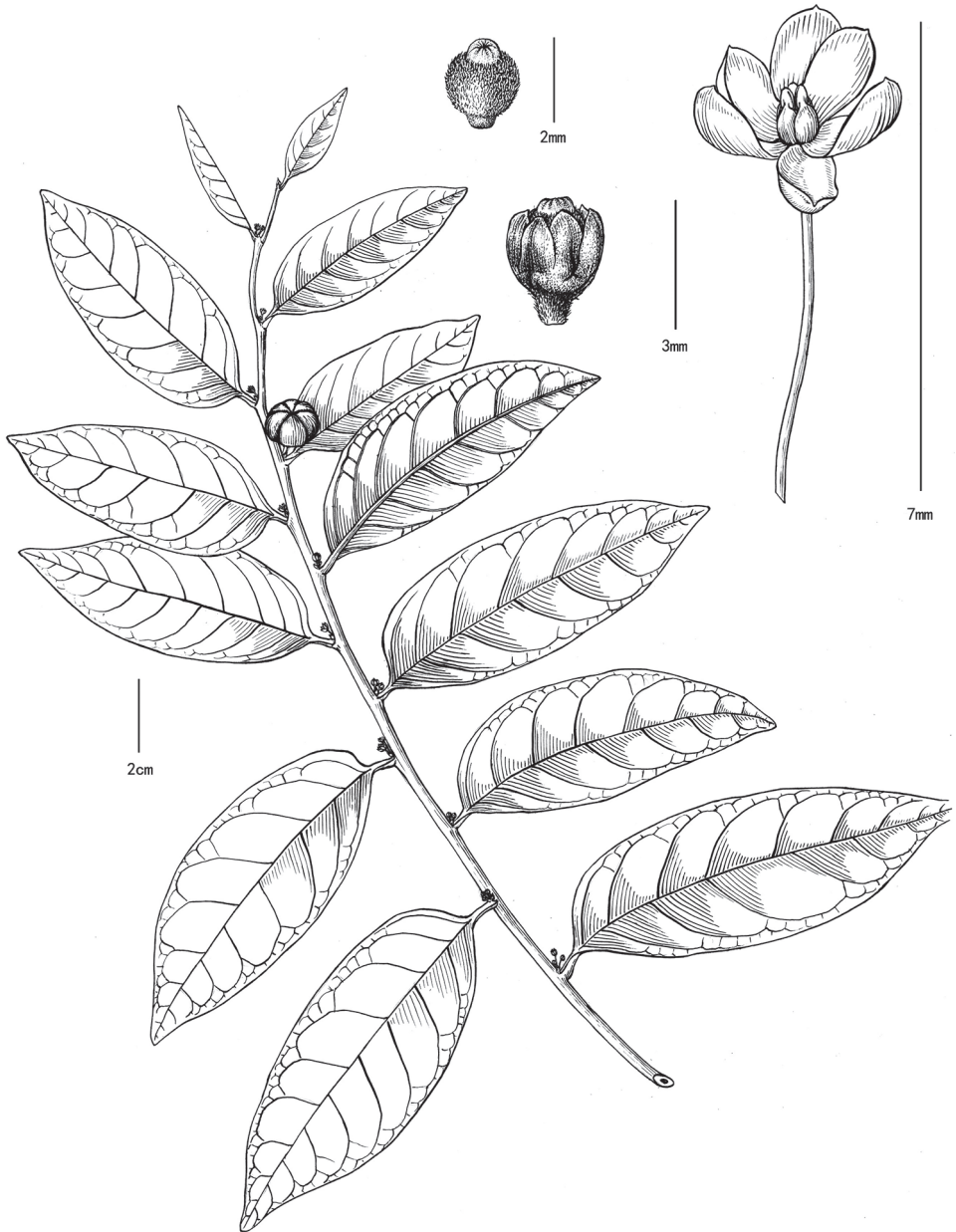
Figure 4. Glochidion lanyuense Gang Yao & S.X. Luo, sp. nov. (based on the holotype, drawn by Y.X. Liu) A habit B ovary and style C female flower D male flower.

long, truncate at apex, densely strigose at base, 5–6-lobed apex, and then shallowly 2-lobed for each lobes. Capsules depressed globose, ca. 10 mm in diameter, sub-glabrous, 5–6-grooved.