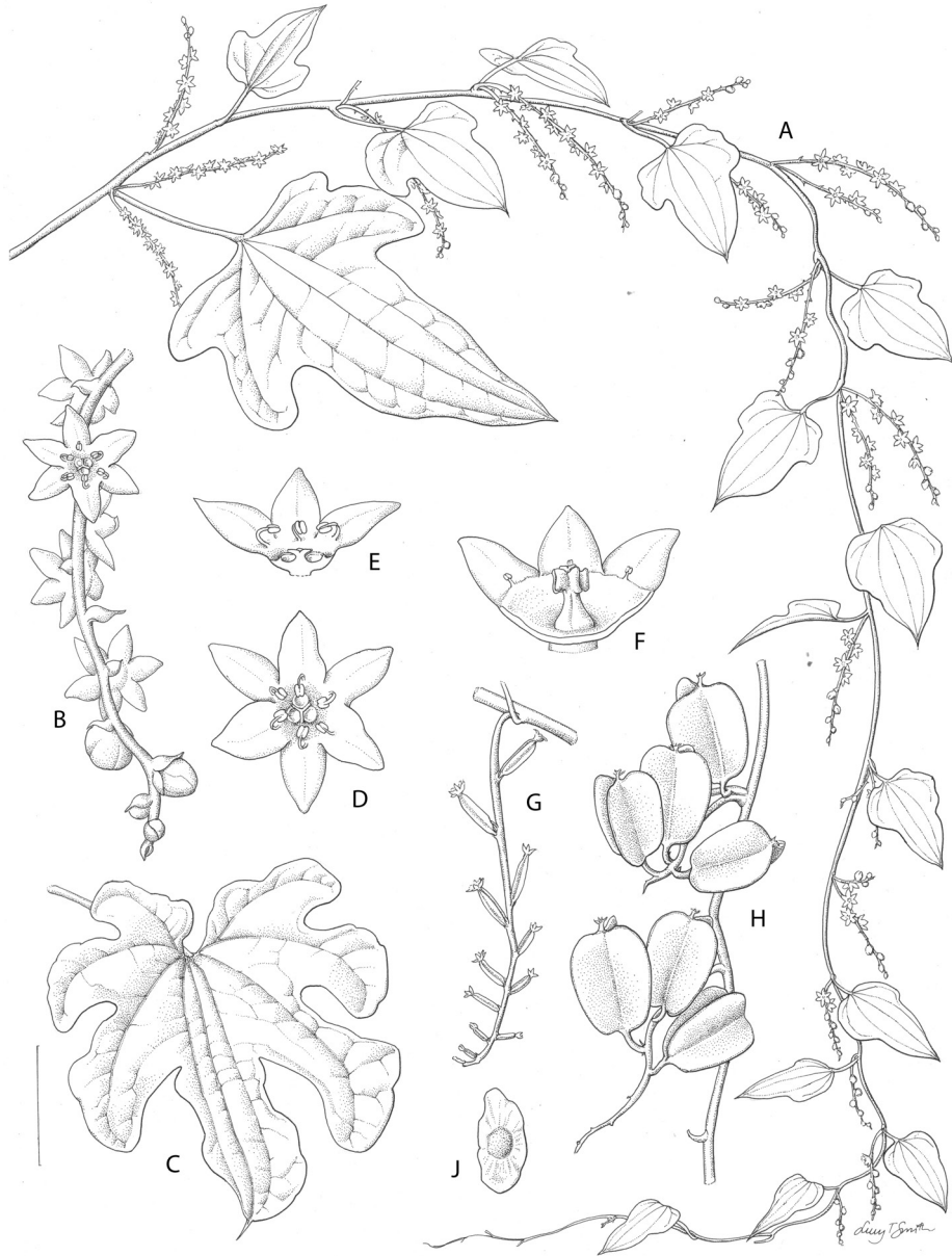
Figure 2. Dioscorea multiloba Kunth vegetative and reproductive morphology. A Habit of male plant with axillary inflorescences B Apical part of male inflorescence showing tepal shape and habit and bud shape habit C Lobed leaf showing venation of upper surface and forerunner tip D Male flower from above showing filament habit E Male flower with 3 tepals and part of torus removed showing torus shape, pistillode and associated concavities in torus surface F Female flower with 3 tepals and part of torus removed showing torus shape, staminodia and gynoecium G Female inflorescence showing tepal habit and ovaries H Infructescence showing some submature capsules with persistent tepals J Seed showing wing shape. Scale bar: A, C 3 cm; B 7 mm; D, E 4 mm; F 3 mm; G, H 2.5 cm; J 2 cm. From Ward 3076 ( A, B, D, E ), Medley Wood 329 ( F, G ), Gueinzus s.n. ( H, J ) and a photograph ( C ). Drawn by Lucy Smith.