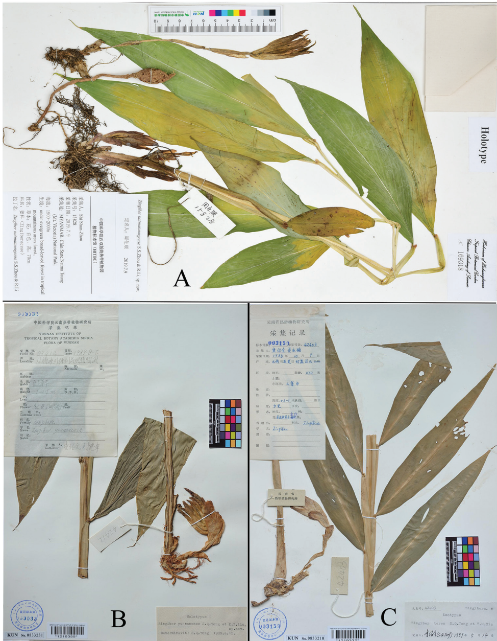
Figure 2. A Holotype of Zingiber natmataungense S.S.Zhou & R.Li, sp. nov. (S.S. Zhou. 15828, HITBC Acc. No. 169318) B holotype of Z. yunnanense S.Q.Tong et X.Z.Liu (Tong, S.Q. & Liu, X.Z. 42412, KUN Acc. No. 0833231) C isotype of Z. teres S.Q.Tong et Y.M.Xia (Tong, S.Q. & Xia, Y.M. 42403, KUN Acc. No. 0833210).

Description. Pseudostems 50–80 cm, base with purplish-red sheaths. Rhizome yellow, aromatic. Leaves subsessile, ligule 2-lobed, 2–3 mm, sparsely pubescent; leaf blade green, abaxially light green, lanceolate or narrowly, ca. 5–25 × 3–5 cm, glabrous,