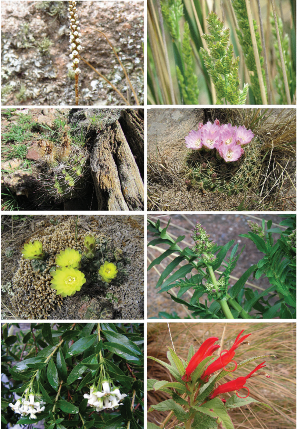
Figure 3. Representative endemic taxa of the Sierras CSL. (Clockwise) Aa aachalensis , Poa stuckertii , Acanthocalycium spiniflorum , Gymnocalycium monvillei , Gymnocalycium andreae , Valeriana ferax , Escalonia cordobensis , Siphocampylus foliosus var. glabratus .