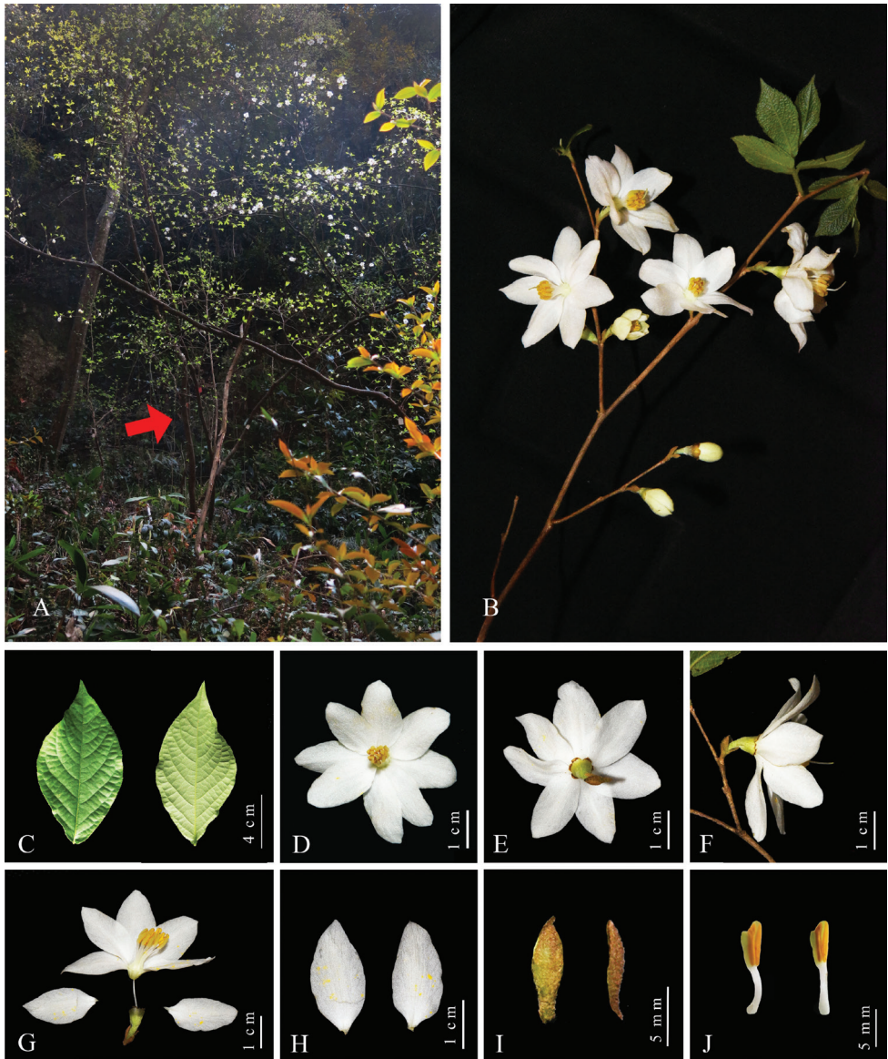
Figure 3. Styrax zhejiangensis (Jiande, Zhejiang, China) A habitat and habit B inflorescence C leaf blades D flower (top view) E flower (back view) F flower (side view) G opened flower H corolla lobes I sepals (two sepals pulled apart at the lobe margins of one calyx) J stamens.

Distribution and habitat. Styrax macrocarpus is distributed between southeastern Hunan and western Guangdong (Fig. 2). It grows in sparse forests, valleys or at forest margins at elevations between 130 and 230 m a.s.l.