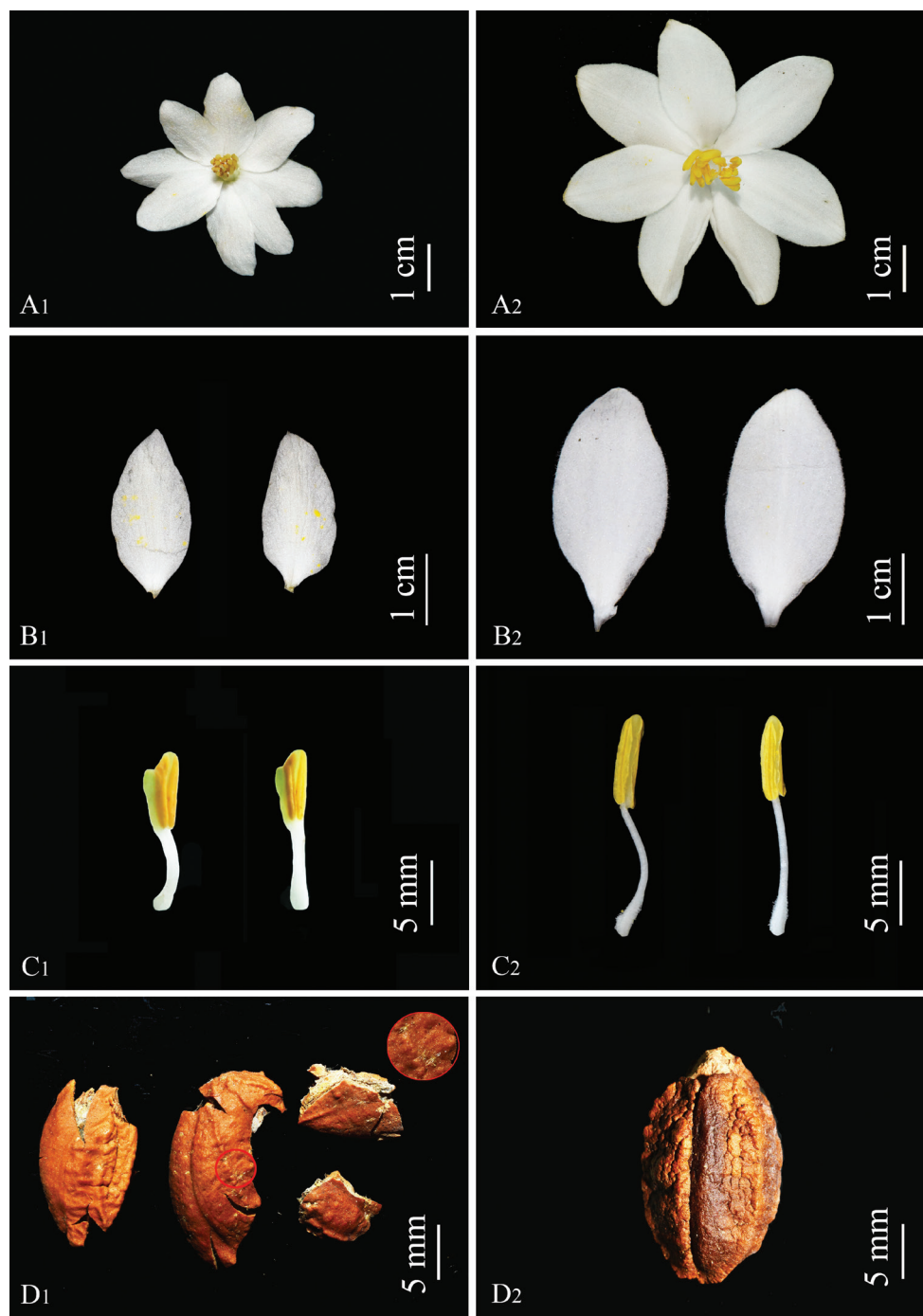
Figure 5. Morphological comparison between Styrax zhejiangensis ( A1, B1, C1, D1 ) and S. macrocarpus ( A2, B2, C2, D2 ). A1, A2 Flower B1, B2 corolla lobes C1, C2 stamens D1, D2 seed (Note the enlarged stellate trichomes in the red circle in figure D1 ).