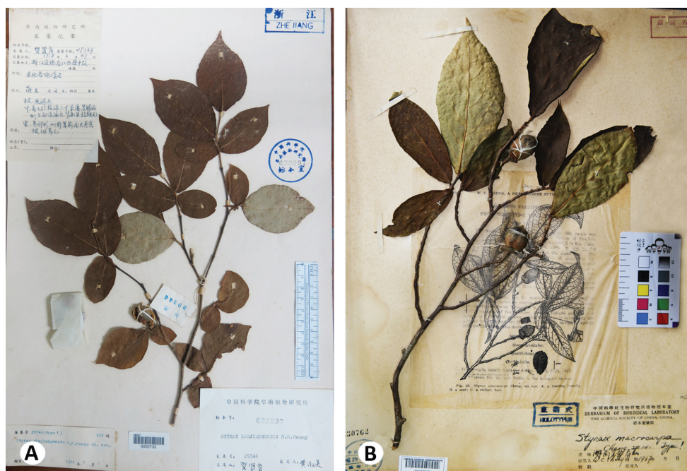
Figure 1. Lectotype sheet of Styrex zhejiangensis , China, Zhejiang, Jiande, X. Y. He 29344 (IBSC) (A) and holotype sheet of S. macrocarpus , China, Hunan, Yizhang, Mang mountain, W. C. Cheng s.n. (PE) (B).

synonymized with S. macrocarpus by Huang et al. (2003). Huang et al. (2003) purported that there were no essential morphological differences between the two species emphasized by Hwang (1983) other than the presence of stellate trichomes on the seeds in S. zhejiangensis versus their absence in S. macrocarpus , a difference which they regarded as taxonomically trivial. According to Huang et al. (2003), S. macrocarpus sensu lato is a species with a disjunct distribution between southeastern Hunan and western Guangdong (Fig. 2).