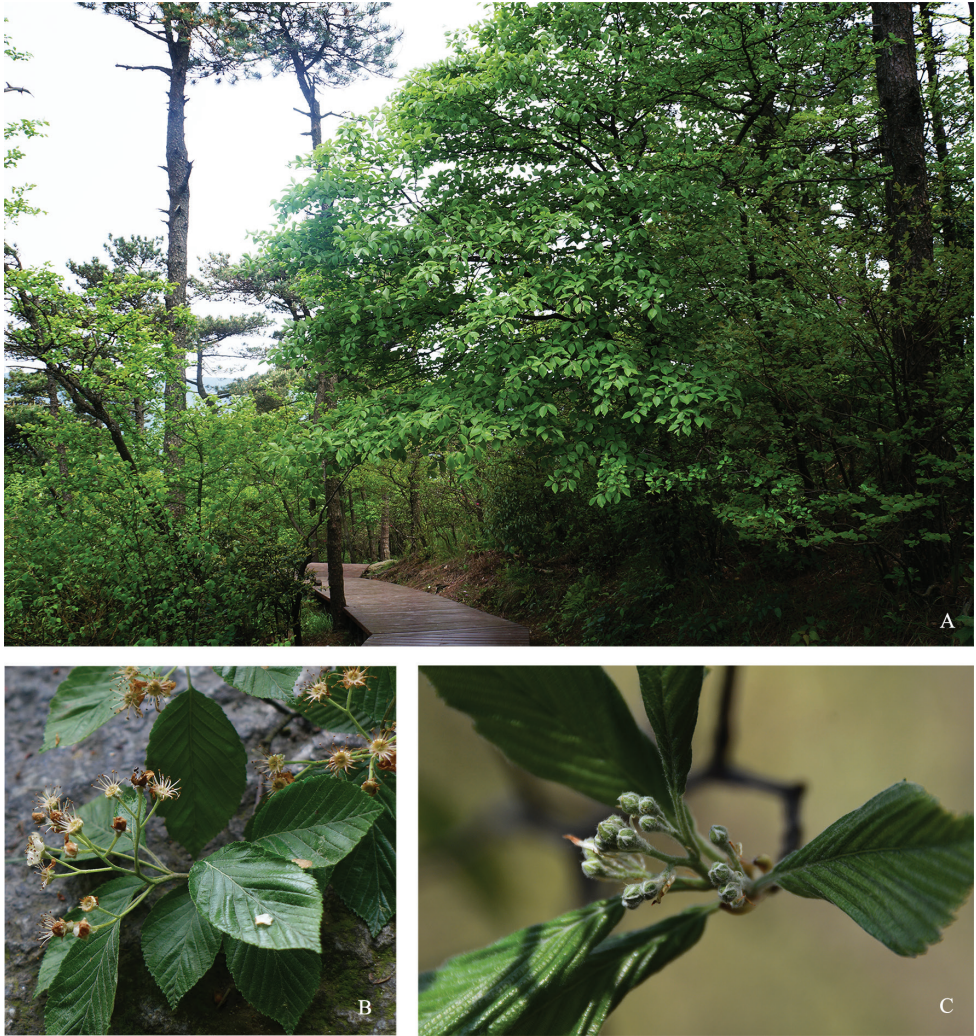
Figure 2. Sorbus lushanensis sp. n. A habit (A plant at Wulao Peak, Lushan National Park, Jiangxi province) B flowering branch and leaves (from the plant of type specimen) C young inflorescence (from the same plant as habit).

lenticels. Fruit orange-red, oblong to ovoid-oblong, 7.8–11.3 mm long, 4.2–7 mm in diam., 2-loculed, sparsely lenticellate, with an annular scar of the deciduous sepals and white tomentose inside it apically. Seeds brown, 5.46–6.48 mm long, 2.88–3.62 mm in diam., 2.04–2.72 mm thick.