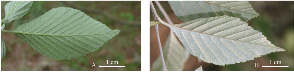
Figure 5. Leaf abaxial surface of A Sorbus lushanensis and B S. folgneri , show the similar of leaf form and the differences of hairs.

molecular work, based on two chloroplast gene fragments, atpB-rbcL and trnL and four nuclear gene fragments, GBSSI , PGIP , PPO and WD , resolved that S. lushanensis formed as sister to S. alnifolia var. angulata S. B. Liang and they two together were resolved as sister to S. folgneri , suggesting that S. lushanensis is not most closely related to S. folgneri (Chen et al. unpubl. data). The new species can be distinguished from the other five species by its abaxially greenish-grey tomentose laminae.