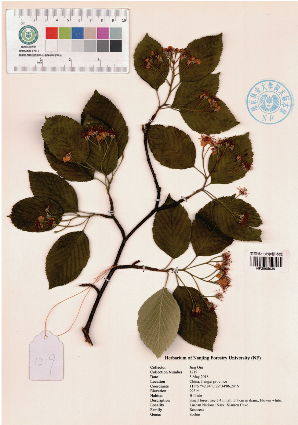
Figure 1. Holotype of Sorbus lushanensis sp. n.