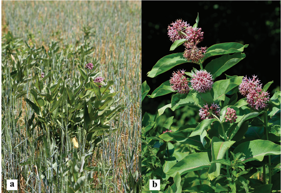
Figure 1. Asclepias speciosa in a field of winter wheat (a) and at the edge of a woodland (b).