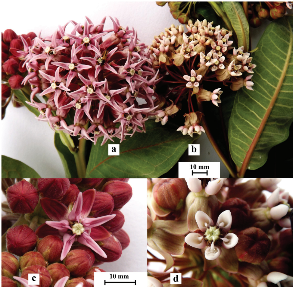
Figure 2. Inflorescences and individual flowers of Asclepias speciosa (a, c) and Asclepias syriaca (b, d).