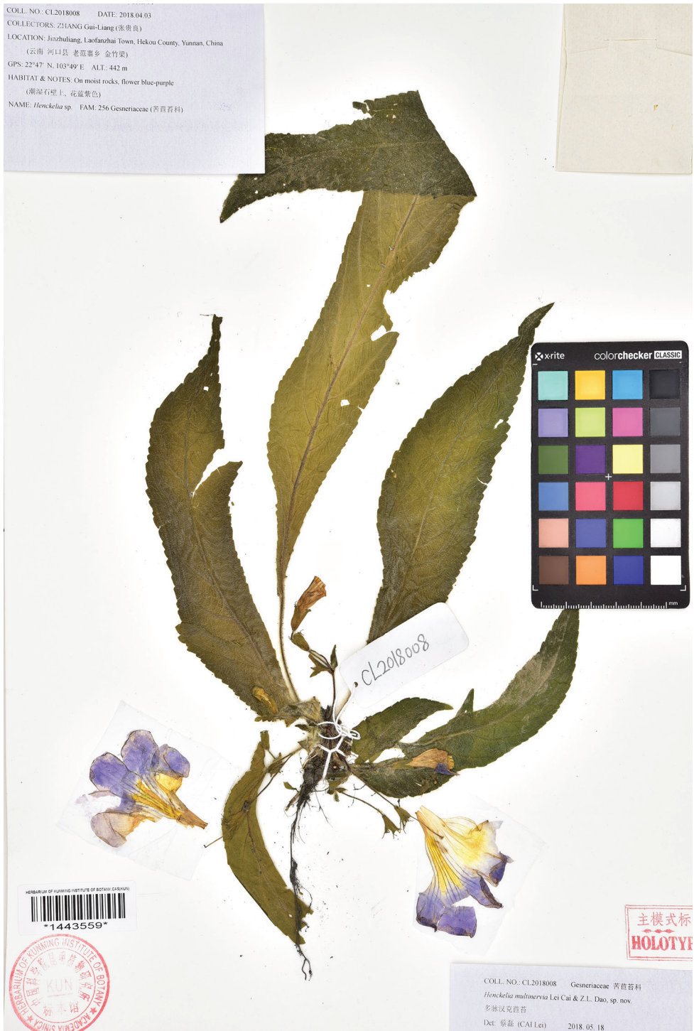
Figure 4. Holotype of Henckelia multinervia Lei Cai & Z.L.Dao (KUN-1443559).