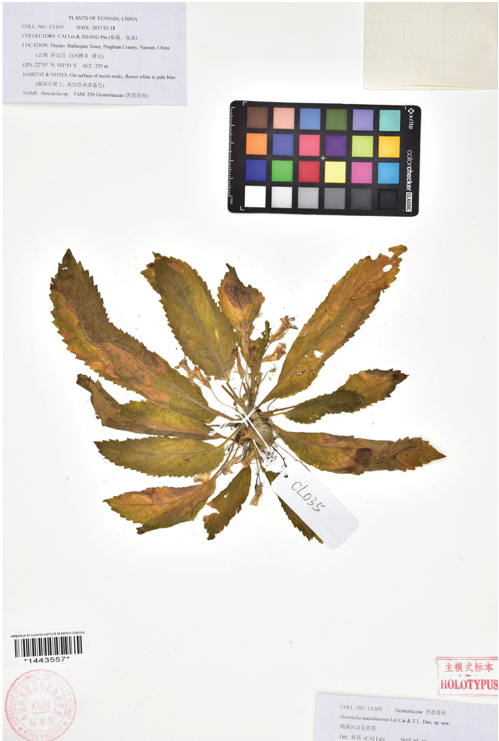
Figure 2. Holotype of Henckelia nanxiheensis Lei Cai & Z.L.Dao (KUN-1443557).