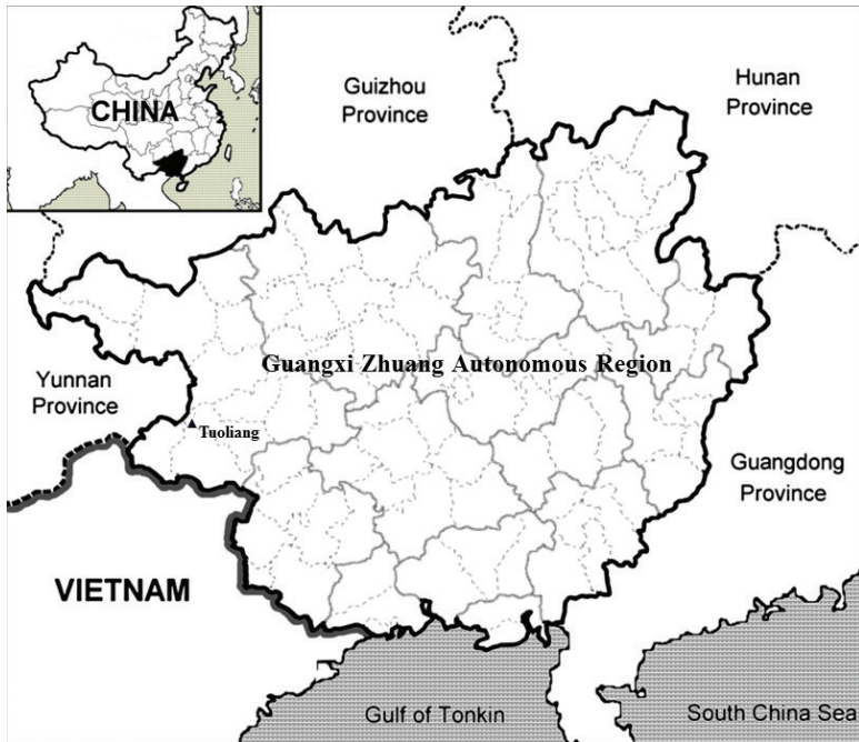
Figure 3. Map showing distribution of Camellia debaoensis R.C.Hu & Y.Q.Liufu, sp. nov. in southwestern Guangxi, China.