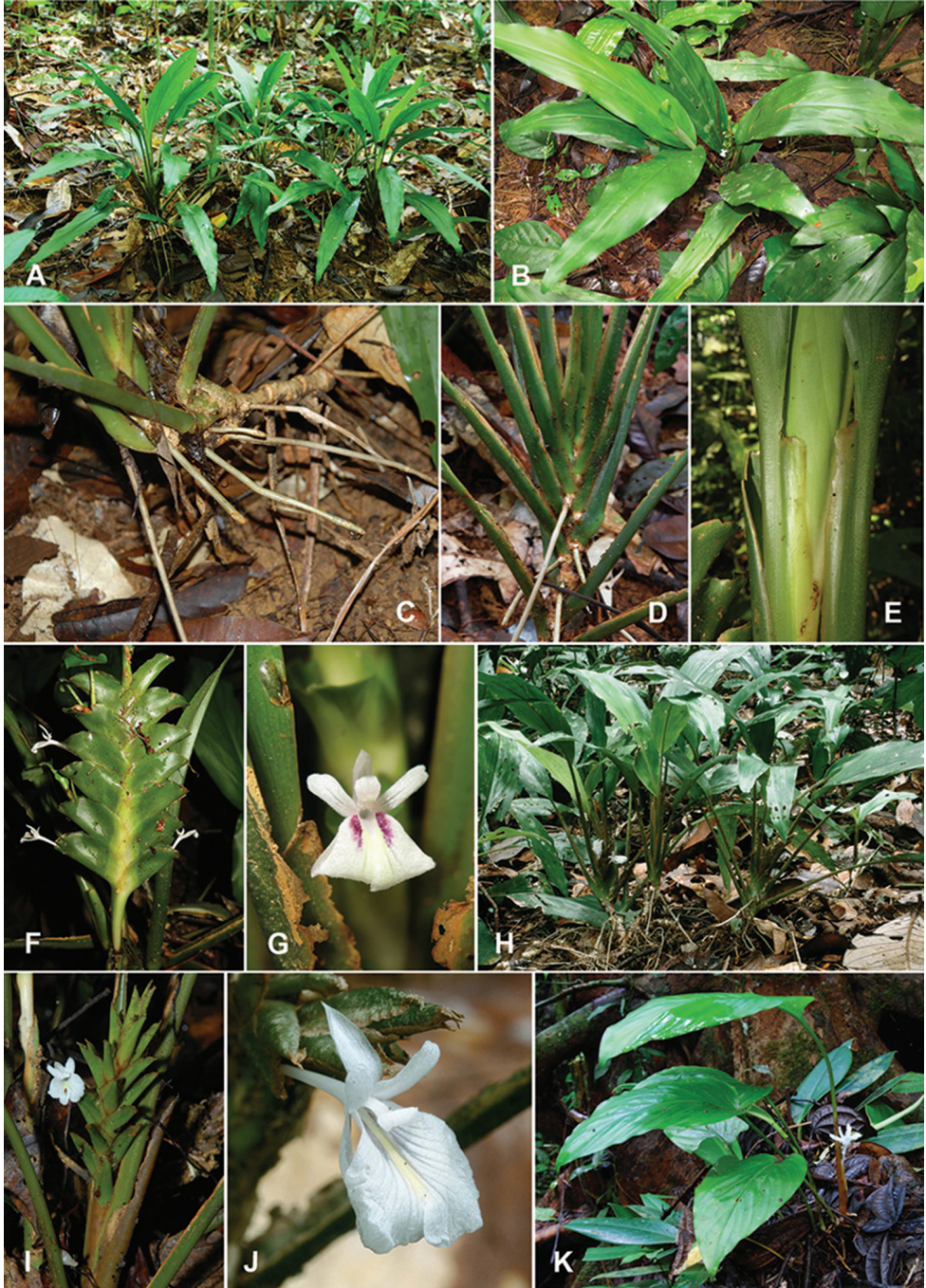
Figure 1. A–G Scaphochlamys disticha : A Habit B Leafy shoots close together C Rhizome and stilt roots D Distichous leaf sheaths E Thin and broad margin of leaf sheath F Inflorescence G Flower H–J S. klossii var. klossii H Habit I Inflorescence J Flower K S. calcicola .