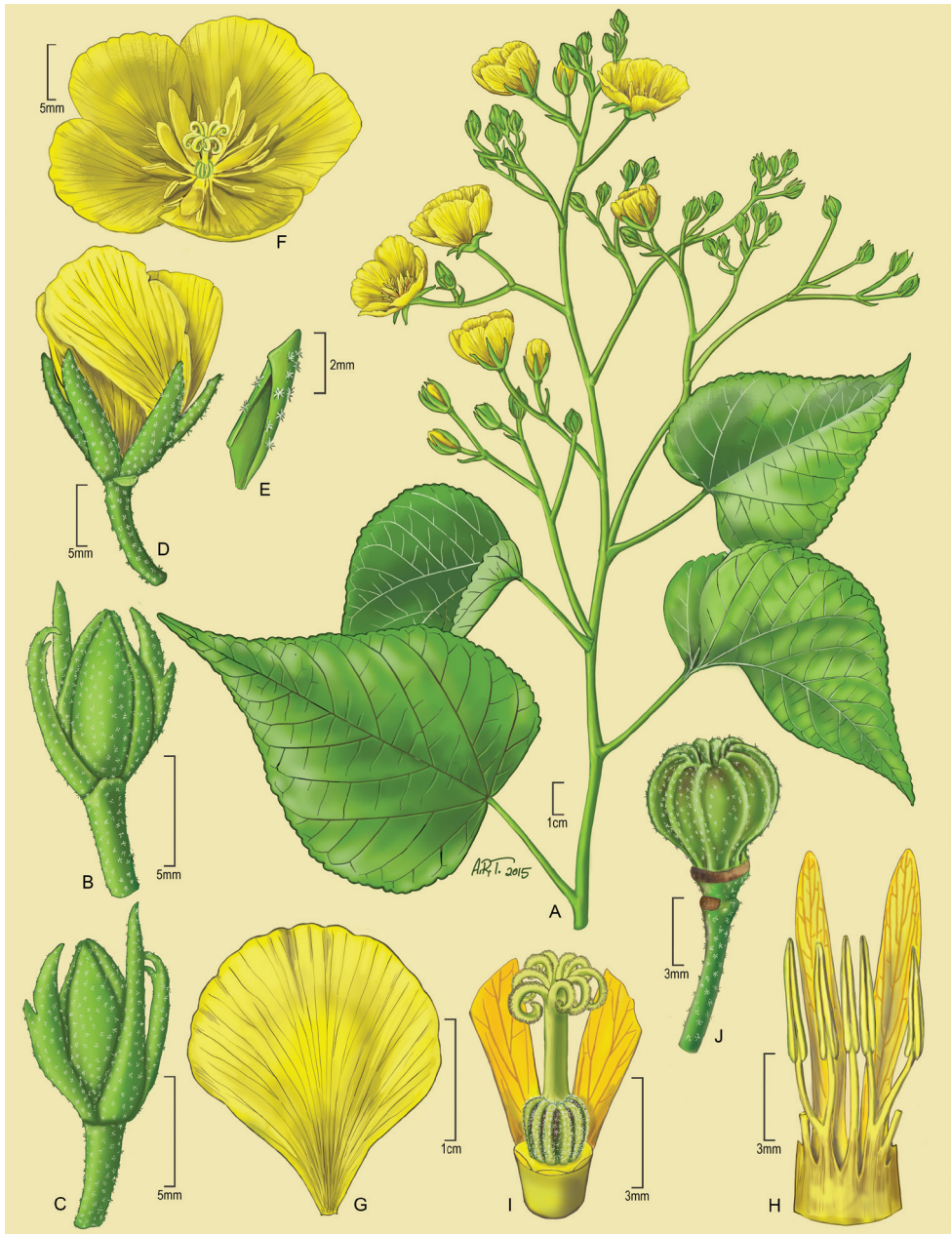
Figure 1. Eriolaena rulkensii . A Habit B, C Flower buds with 3 epicalyx bracts each D Immature flower with petals (yellow), sepals (green) and scar of one dehiscent epicalyx bract E Detail of sepal F Flower at anthesis showing petals, anthers, staminodes and gynoecium G Detail of petal H Detail of androecium showing androecial tube, anthers in fascicles and staminodes I Gynoecium and base of two staminodes J Immature capsule showing scars from dehiscent calyx lobes and epicalyx bracts.