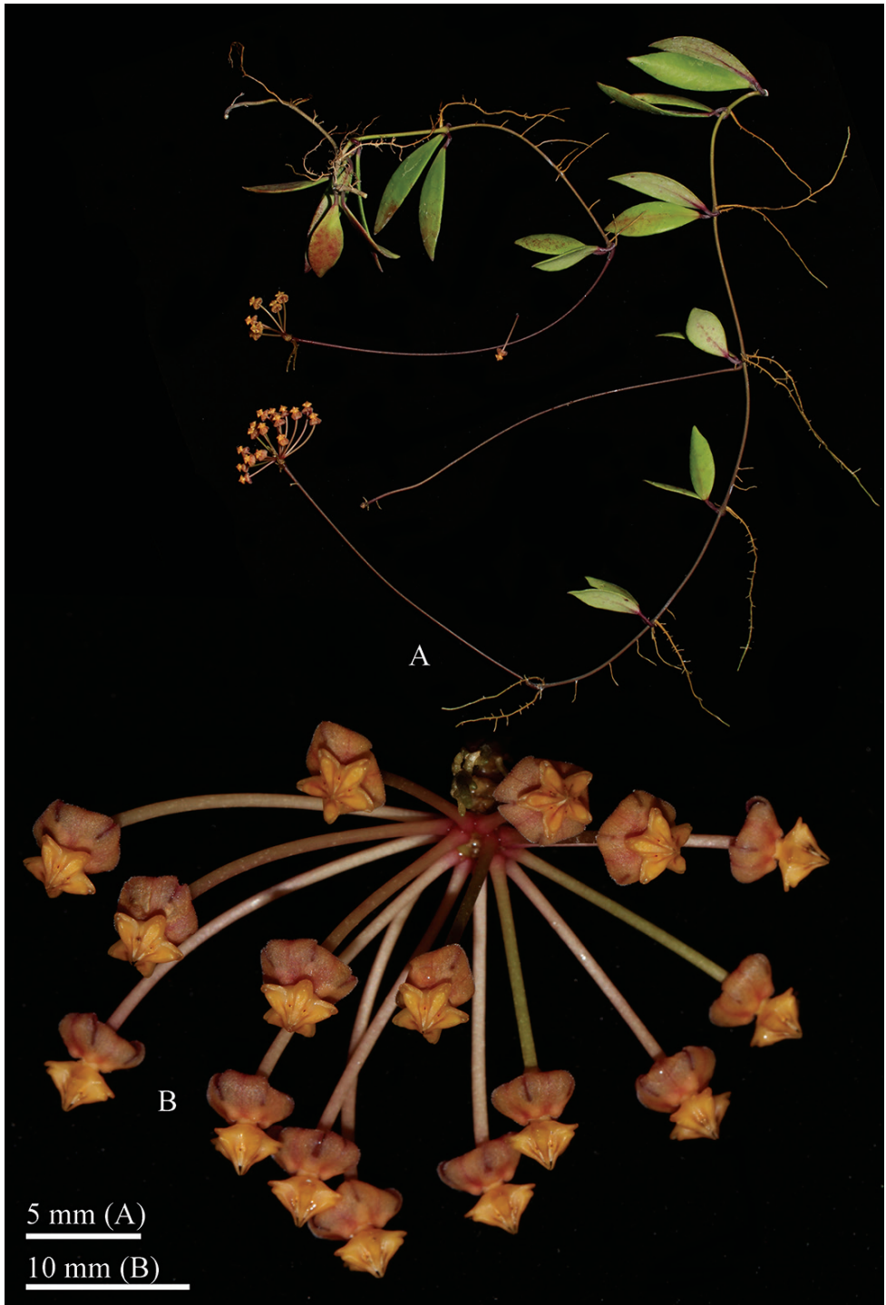
Figure 3. Hoya loberi photographed from Rodda M MR748 (SING) prior to pressing A Leafy branch and inflorescence B Inflorescence.