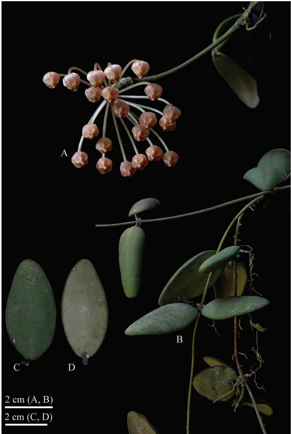
Figure 2. Hoya migueli photographed from R. Pimentel s.n. (CMUH) prior to pressing A Inflorescence B Branch C, D leaf ( C adaxial surface D abaxial surface).