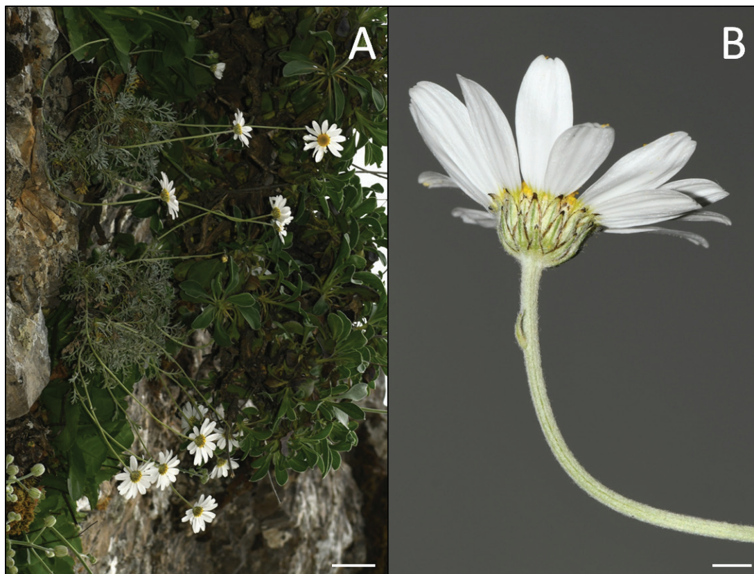
Figure 5. Anthemis pasiphaes at its locus classicus A plant growing on a vertical rock B capitulum. Scale bars: 5 cm ( A); 5 mm ( B).