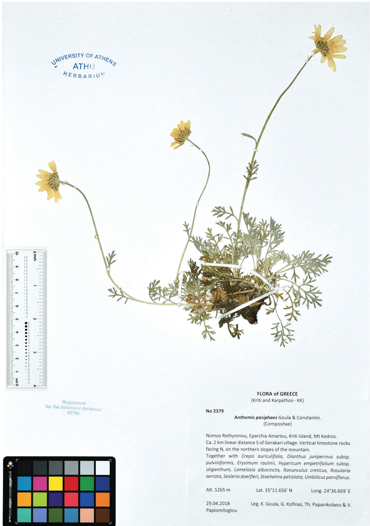
Figure 3. Holotype of Anthemis pasiphaes Goula & Constantinidis (ATHU).