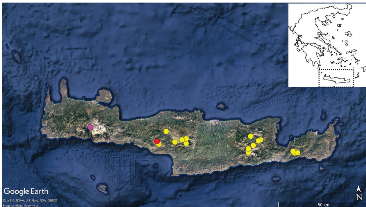
Figure 2. Distribution of Anthemis sect. Hiorthia on Kriti Island. Pink dot: A. samariensis , red dot: A. pasiphaes , yellow dots: A. abrotanifolia . Based on Strid (2016b) and additional specimens in ATHU, MAIC and NHMC. Background map data: Google, SIO, NOAA, U.S. Navy, NGA, GEBCO.

between A. cretica subsp. carpatica and A. pindicola Halácsy problematic. Grierson (1975) himself characterised his A. cretica group classification as “possibly oversimplified” and “tentative” and underlined the necessity of a biosystematic study within the group. The inclusion of new taxa within an even broader A. cretica complex would add intricacy to the whole structure. Cutting-edge molecular tools, when used, would presumably help in elucidating phylogeny and would offer a classification scheme in compliance with evolutionary patterns.