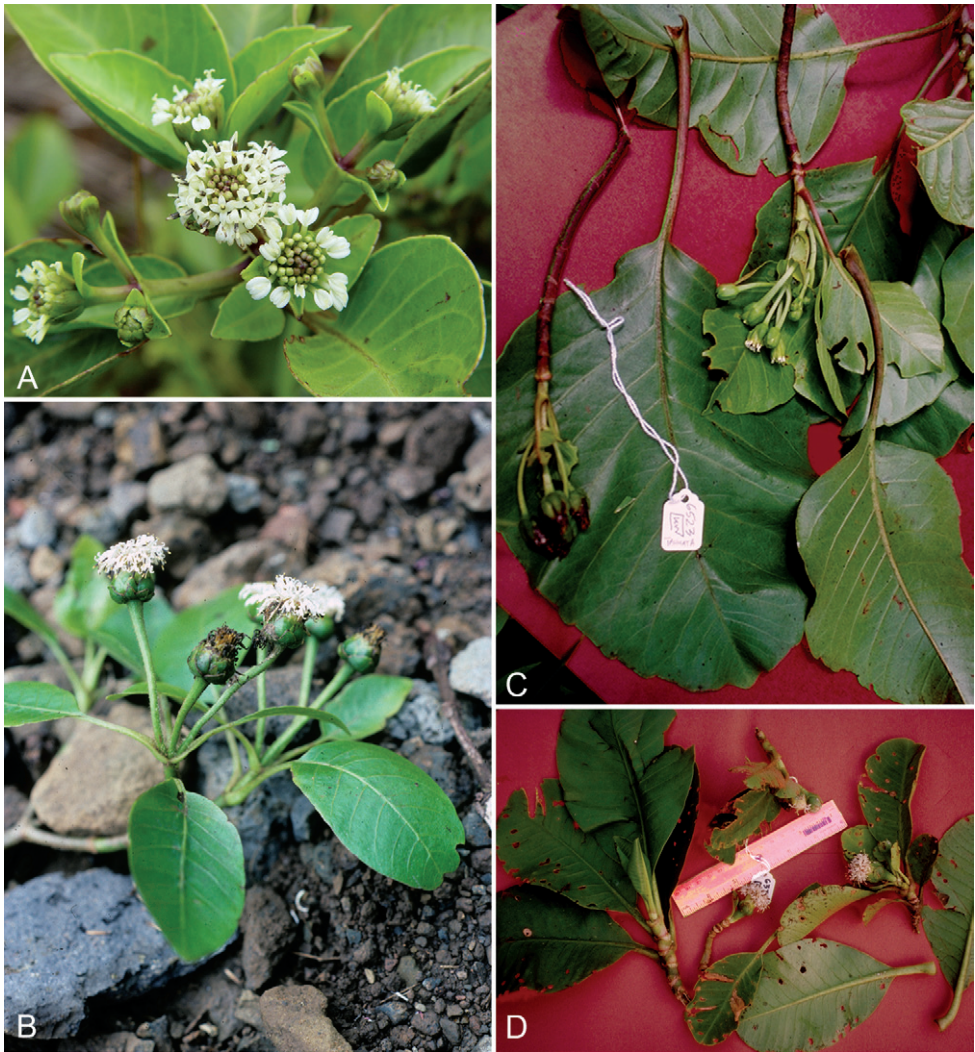
Figure 3. Field images of Oparanthus . A O. hivaoanus , (Hiva Oa, Price et al 201, photo D. Lorence) B O. teikiteetini (Nuku Hiva, Lorence 6078, photo D. Lorence) C O. tiva (Tahuata, Wood 6523, photo K. Wood) D O. woodii (Nuku Hiva, Wood 6338, photo K. Wood).

mm long. Ray achenes elliptic, 5–6 mm long, distinctly winged, the wings ca.1 mm wide, extending slightly beyond the achene apex; disk achenes sterile, linear, 10–11 mm long, with 2 awns.