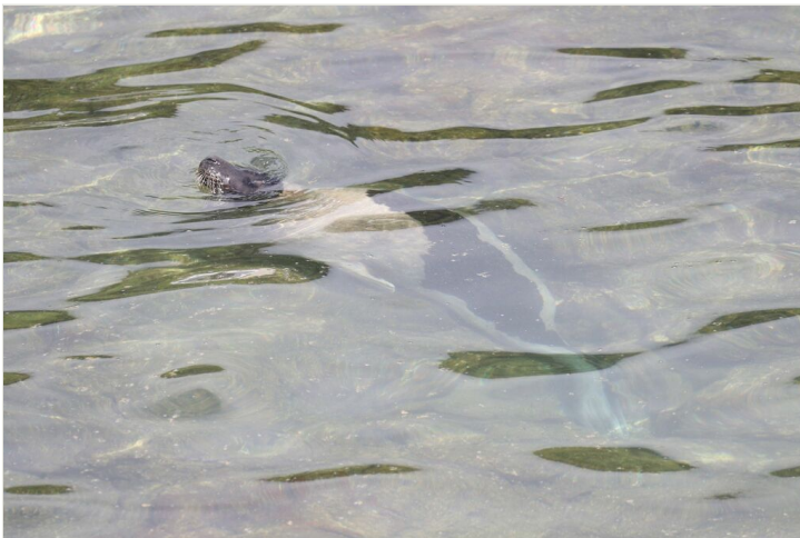
Figure 4. doi

Harp seal Pagophilus groenlandicus (Erxleben, 1777) on 23 August 2020 on Lajes do Pico.