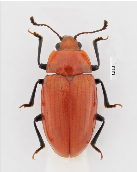
Figure 1. doi

Body elongate-oval, convex dorsally, smooth and shining. General colour orange-yellow, the front edge of clypeus, legs and antenna black (Fig. 1). Head (Fig. 2a) small, with fine and sparse punctures. Clypeus without margin, anterior border emarginate. Frontoclypeal suture incomplete, presence on both sides. Compound eye small, prominent, finely faceted; interocular distance about 0.7 times width of head. Antenna (Fig. 2b) long and slender, exceeding the basal edge of pronotum, with golden setae; antennomere I rather large; antennomere III longer than others, antennomeres IV–VII nearly equal; antennomere VIII slightly wider than VII, but significantly narrower than IX, antennomere IX triangular; antennomere X bowl-shaped; antennomere XI regularly rounded; relative lengths of antennomeres II–XI: 1.0: 1.6: 1.3: 1.2: 1.2: 1.2: 1.1: 1.4: 1.0: 1.4. Maxillary terminal palpomere (Fig. 2c) extremely wide, nearly 5 times as wide as long. Labial terminal palpomere (Fig. 2d) rubber hammer-shaped. Mentum (Fig. 2e) pentagon, middle area depressed; submentum small, trapezoidal.