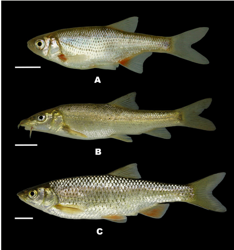
Figure 1. doi

ichthyologists, ecologists, conservation biologists and managers of areas of nature protection.