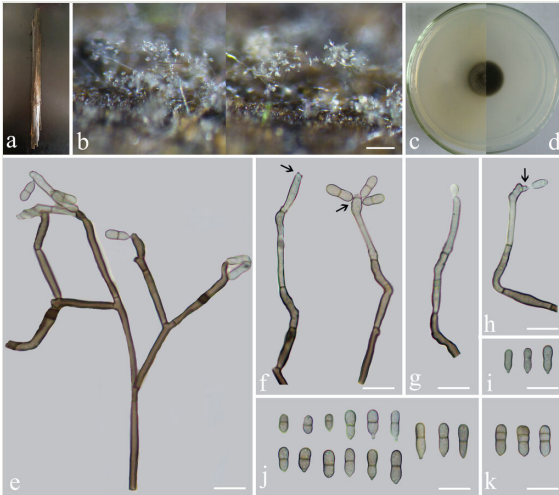
Figure 2. doi

Veronaea aquatica (HFJAU0739, holotype) a Submerged bamboo; b Colonies on submerged bamboo culm; c, d Colony on PDA from above and below; e–h Conidiophores, conidiogenous cells and conidia; note the scars (arrowed in e, d); i–k Conidia. Scale bars: b = 100 \mu\text{m} , e–k = 10 \mu\text{m} .