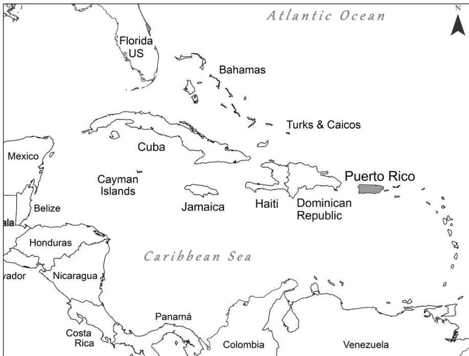
Figure 1. doi

Biogeographical distribution regions according to Good (1974), modified by Christiansen and Bellinger (1995) and Culik and Zeppelini (2003), were summarised for each species as follows: Boreal, Neotropical, South African, Palearctic, Australian and Antarctic. Species distributed in four or more major regions are considered cosmopolitan (Abrantes et al. 2010, Mari Mutt 1982). The species distribution was extracted from Bellinger et al. (2019). The species reported exclusively from the Puerto Rico Bank were listed as Endemic. Nomenclatural organisation follows that of Bellinger et al. 2019.