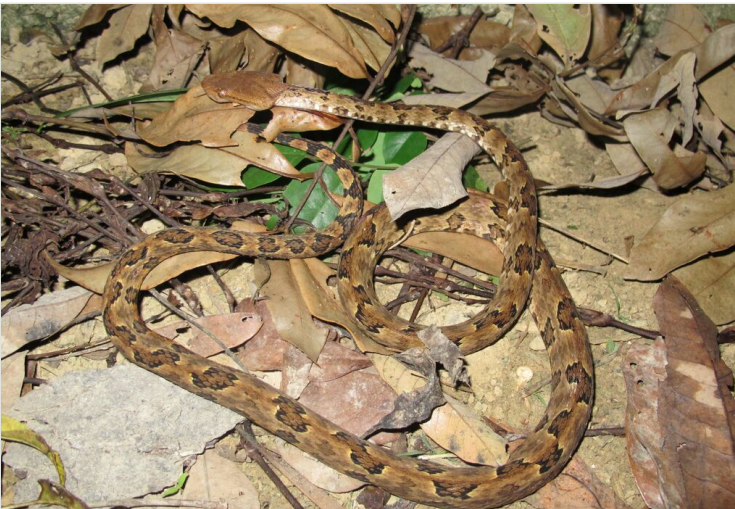
Figure 6. doi

Colouration in life: dorsal head brown, paler below; dorsum greyish-brown, with a series of large brown, dark-edged spots; a dark brown line from the eye to the angle of the mouth, edged in black; ventral surface brownish with white blotches; dorsal tail light brown, with a series of conspicuous black spots (Fig. 6).