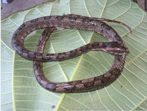
Figure 5. doi

The voucher specimen was found at 20:35 h on the ground. The surrounding habitat was secondary forest composed of medium and small hardwoods, lianes and shrub. Air temperature was 25-30°C and relative humidity was 70-80%.