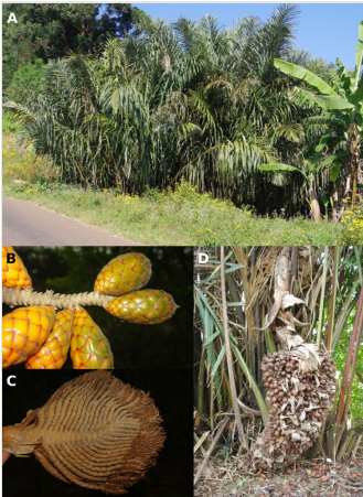
Figure 5. doi

Flowers solitary, exerted, inserted in one row, rarely two on each side of second order rachillae, staminate flowers distal, pistillate flowers basal. Staminate flower: calyx fused, tubular, bearing three shallow lobes; corolla comprising 3 petals, 7–10 mm long, 2.5–3 mm wide, basally connate for 1/3 of their length, oblong, apex acuminate, margins entire, smooth, stiff; stamens 6–8. Pistillate flowers: calyx fused, tubular, bearing three very shallow lobes; corolla comprising 3 petals, 2–4 mm long, separate, basally attached, 3 pointed tips, acuminate, margins irregular, smooth; staminodial ring with 6–7 staminodes, 0.5–2 mm long, fused between them, adnate to petals for ca. 1 mm; anthers sagittate, 0.2–1.5 mm long; gynoecium 3–5.5 mm long, 1.5–2 mm wide, ovary ca. 2.8–5.3 mm, 1.3–1.9 mm wide, ovoid to ovate long, completely covered with scales, developing at 3/4 height of the gynoecium, larger scales at mid portion to base; style absent or very short; stigma ca. 1 mm long, papillae not observed (flowers young). Fruits ellipsoid, oblong to obovoid, 6–9 cm long, 2.5 (young) –5 (mature) cm large, pointed beak 3.7–4.5 mm long, ca. 3 mm wide; (usually wider towards the beak), scales 8–10 rows (usually 9); seed 1 oblong, 2.5–7 cm long, 2–3 cm wide, with ruminated endosperm (Fig. 5).