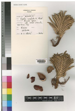
Figure 3. doi

In the latest revision of the genus, Otedoh (1982) placed the name R. vinifera in the “raphiate” section, probably following the fruiting description (and illustration) of R. vinifera (Palisot de Beauvois 1804). Interestingly, he associated very few uses to the species (“would yield good thatch and bamboos” page 162), suggesting it was sacred and generally protected. In the same publication, Otedoh (1982) described the new species R. mambillensis Otedoh (Otedoh 7401; Fig. 3) in the flabellate section (planar shaped partial inflorescences). This species was described as a small Raphia palm with a subterranean stem and leaves 5–8 m long arising from the ground. It is a common species mainly growing between 1200 and 2000 m in the Cameroonian Volcanic Line and reported from Nigeria, Cameroon, Central African Republic and South Sudan (Chevalier 1932, Letouzey 1978). Interestingly, Otedoh (1982) also noted that R. mambillensis grows alongside streams or in swamps at lower altitudes (page 164). Raphia mambillensis is a widely-used palm for wine, thatching and as a source for grubs. Prior to Otedoh (1982), R. mambillensis used to be confused with R. farinifera (e.g. Russell 1965). In addition, Otedoh (1982) also described a new variety: R. vinifera var. nigerica Otedoh, distinct by the symmetrically opposite leaflets.