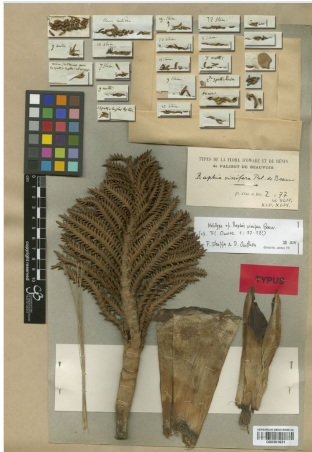
Figure 4. doi

Herbarium” in Geneva. He does not, however, provide more details about the specimen. In an unpublished PhD thesis, Otedoh (1976) identified Palisot de Beauvois s.n. from the districts of Warri and Benin as the type (page 245). Finally, Stauffer et al. (2017), in an overview of taxonomic knowledge on African palms, provided a scan of a Palisot de Beauvois s.n. collection from G and suggested it was the holotype of R. vinifera (barcode: G00301631, Fig. 4). We have now identified seven specimens belonging to the collection Palisot de Beauvois s.n. , with isotypes deposited in five herbaria (see below). This specimen is composed of a partial inflorescence with young flowers and large bracts, belonging to the flabellate type, and is clearly what is illustrated in Fig. 1A of Palisot de Beauvois (1804). To date, we did not find any Raphia specimens collected by Palisot de Beauvois with fruits.