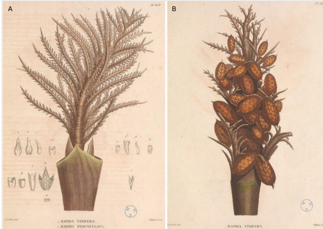
Figure 1. doi

illustration of the fruits (Fig. 1B) are certainly from a different species than the inflorescences. In their description of R. vinifera (page 437), Mann and Wendland (1864) cited a specimen collected by Mann s.n. from the “Banks of the Old Calabar” as being R. vinifera . We were not able to locate this particular specimen (neither in K nor GOET).