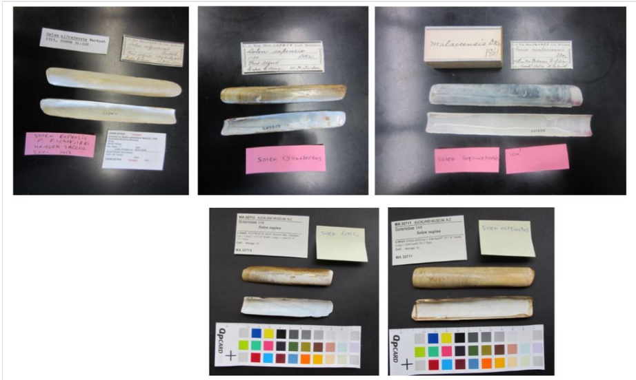
Figure 1. doi

Mis-identifications of five species in Auckland and Smithsonian museums. About 35 species (150 specimens) in different museums were re-identified. The top three species were re-identified in Smithsonian (correct identification labels as pink sticker). The last two images show that Solen fonesii and Solen marginatus (correct identification labels as yellow sticker) were mis-identified as Solen vagina .