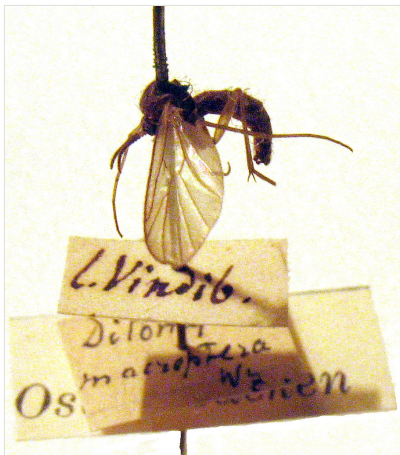
Figure 3. doi

Ditomyia macroptera Winnertz, male specimen in the collection of C.R. Osten-Sacken in Zoological Institute, Russian Academy of Sciences, St. Petersburg.