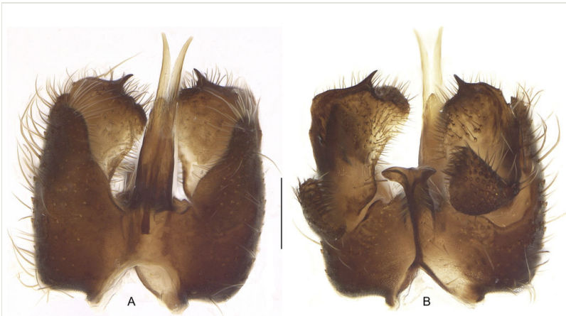
Figure 2. doi

The imago of D. macroptera (Fig. 1) is large (up to 8 mm; about 5 mm in D. fasciata ), dark brown to blackish (yellowish-brown in D. fasciata ), while the wings are uniformly smoky (smoky with 2 light transverse bands in D. fasciata , cf. Kurina and Grootaert 2016: fig. 5A). The male and female terminalia are previously figured by Zaitzev (Zaitzev 1978: fig. 6, Zaitzev 1994: fig. 24-3,7). The male terminalia of the studied specimen from Bulgaria are provided in lateral (Fig. 1), dorsal and ventral views (Fig. 2).