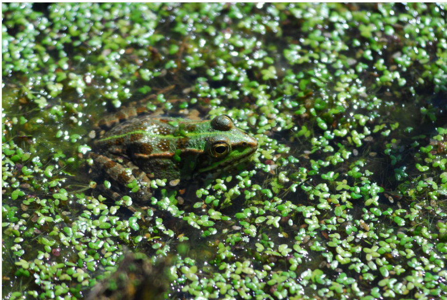
Figure 4. doi

The Iberian water frog Pelophylax perezii.