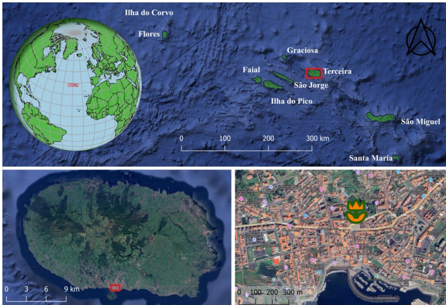
Figure 1. doi

stereomicroscopes and hand lenses to examine finer details of specimens, which are crucial for the identification of smaller species like insects, spiders or lichens. The combination of in situ observations with subsequent laboratory work is a well-established and complementary method in biodiversity assessments. Laboratory work allows for detailed taxonomic verification. Preserved specimens serve as vouchers that can be re-examined, compared against reference collections and used for DNA barcoding, ensuring robustness in species identification. The sampling was conducted under the necessary permits and ethical guidelines. The number of specimens collected was minimised to balance scientific needs with conservation imperatives.