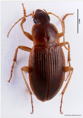
Figure 2. Male of Calathus lundbladi from Tronqueira (S. Miguel, Azores).