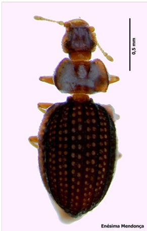
Figure 22. Metophtthalmus occidentalis from Caldeira da Graciosa (Graciosa, Azores).