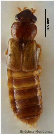
Figure 24. Phloeostiba azorica from Terra Chã (Terceira, Azores).