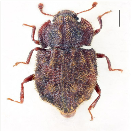
Figure 36. Tarphius tornvalli from Tronqueira (S. Miguel, Azores). Scale 0.5 mm.