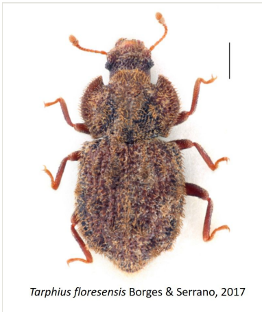
Tarphius floresensis Borges & Serrano, 2017