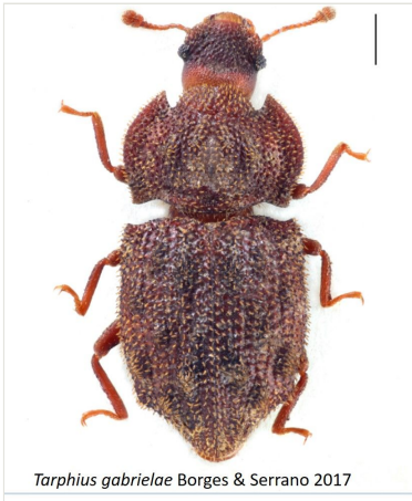
Figure 30. Tarphius gabrielae from Lagoa do Caiado (Pico, Azores). Scale 0.5 mm.