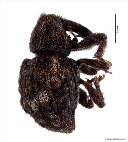
Figure 19. Pseudechinosoma nodosum from Pico Alto (Santa Maria, Azores).