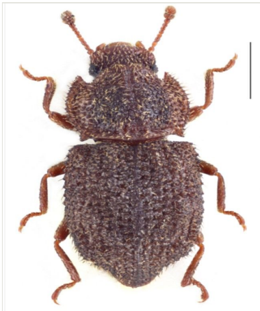
Figure 25. Tarphius acuminatus from Cabecinhos (Pico, Azores) (Credit: Erno-Endre Gergely). Scale 0.5 mm.