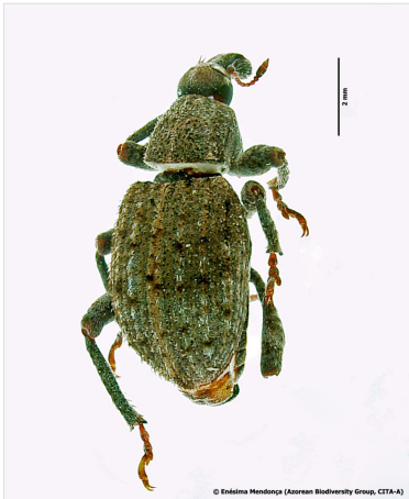
Figure 14. Donus multifidus from Pico Alto (Santa Maria, Azores) (Credit: Enésima Mendonça).