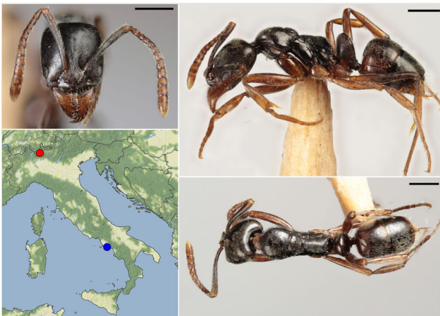
Figure 2. doi

Head, lateral and dorsal view of a Nylanderia vividula worker collected in Rome by Carlos Pradera (scale bars: 0.5 mm) and distribution map of the first Italian records of this species (map from Stadia Maps - stadiamaps.com and Stamen Design - stamen.com).