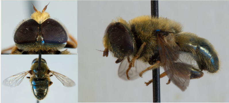
Figure 6. doi

Among the added species noteworthy is the oldest record of Merodon legionensis (Fig. 6) for France (Louboutin and Speight 2021).