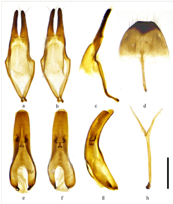
Figure 2. doi

Male terminalia of Uraecha nigromaculata sp. n. a–c parameres; d tergite VIII and sternites VIII; e–g median lobe; h spiculum gastrale. ( a, d, e, h ventral view; b, f dorsal view; c, g lateral view). Scale bar 0.5 mm.