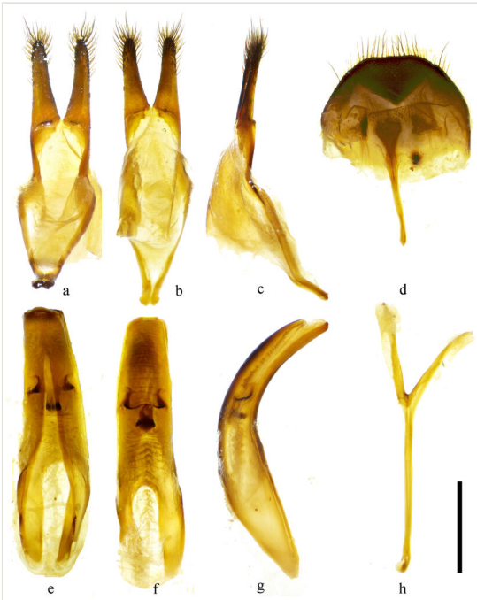
Figure 4. doi

the basal elytral patch obliquely reaches suture at about 2/5 of elytral length (Fig. 1i), while in others (Fig. 1a, b, j), it nearly reaches half of the elytral length. The edge of the large elytral patch behind the middle of elytra is incomplete and the inner margin is not rounded in some individuals (Fig. 1j). The apex of elytra is either subtruncate (Fig. 1a, b) or rounded (Fig. 1i, j).