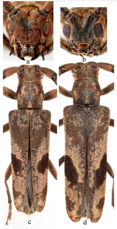
Figure 3. doi

then gradually tapering to apex, with sparse, mostly short setae and only several long setae in U. nigromaculata sp. n. (Fig. 2a–c). In contrast, the lateral lobe gradually constricts from base to apex, with dense short and long setae at about apical 1/2 in U. angusta (Fig. 4a–c); (2) The basal half of median lobe is relatively broad in U. nigromaculata sp. n. (Fig. 2e–g), while it is narrow in U. angusta (Fig. 4e–g); (3) tergite VIII is less arcuated with a subtrapezoidal shape and the apex of the spiculum relictum is not widened in U. nigromaculata sp. n. (Fig. 2d), while tergite VIII is rounded and the apex of the spiculum relictum is widened in U. angusta (Fig. 4d).