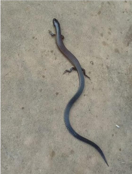
Figure 2. doi

Santa Teresa; verbatimElevation: 790 m; locationAccordingTo: Getty Thesaurus of Geographic Names", "GADM"; verbatimCoordinates: 19 52 54.4S 40 34 27.7W; verbatimLatitude: 19 52 54.4S; verbatimLongitude: 40 34 27.7W; verbatimCoordinateSystem: degrees minutes seconds; verbatimSRS: unknown; georeferencedBy: Cássio Zocca (CZ); georeferenceVerificationStatus: verified by curator; type: StillImage; occurrenceID: 3F14EFEE-48EB-55EC-9A51-25EE0D9F01BF