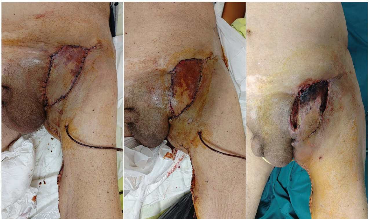
Figure 2. Clinical case 1 – continued.

In our case, venous stasis of the flap was identified within the first postoperative week. LMWH was administered, skin tension was alleviated through partial suture removal, and skin pricking was performed to facilitate blood outflow. Despite these interventions, the congestion gradually progressed to 30% skin and muscle necrosis. Following serial debridement and removal of the titani-