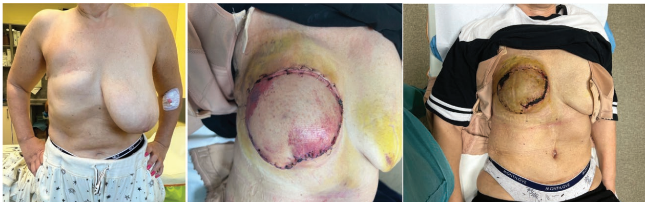
Figure 6. Clinical case 3: venous stasis and necrosis after breast reconstruction with a TRAM flap.