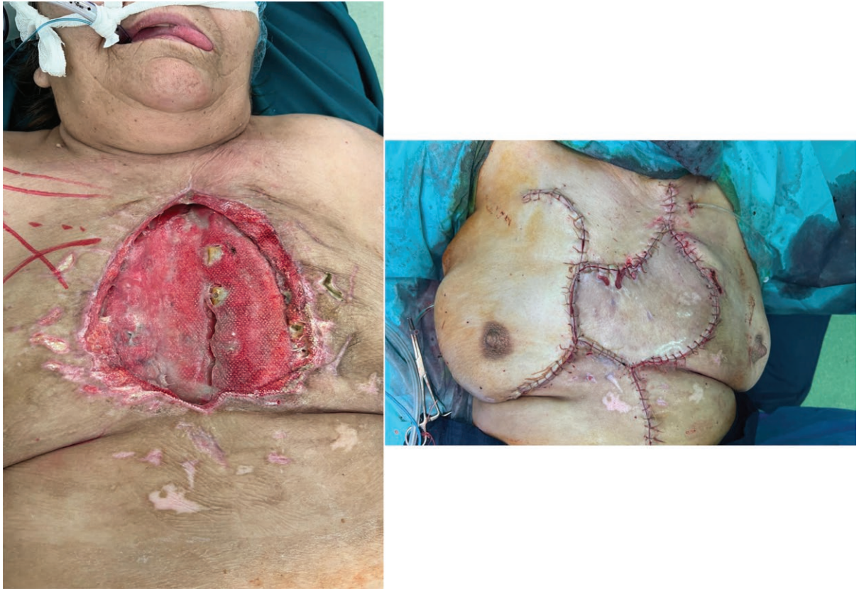
Figure 4. Clinical case 2: defect in the sternal region, reconstructed with a pectoral and local flap.