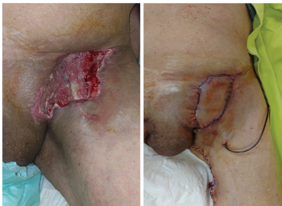
Figure 1. Clinical case 1: skin defect in the inguinal area, reconstructed with a musculocutaneous gracilis flap.

On the third postoperative day, venous stasis was detected, which gradually progressed to involve the distal half of the flap. Examination revealed a hematoma in the adjacent subcutaneous tissues and within the subcutaneous tunnel. Furthermore, a skin-muscle mismatch was identified in the distal portion of the flap. As part of the treatment plan, the patient underwent partial suture removal and evacuation of the hematoma and was maintained on a high-dose