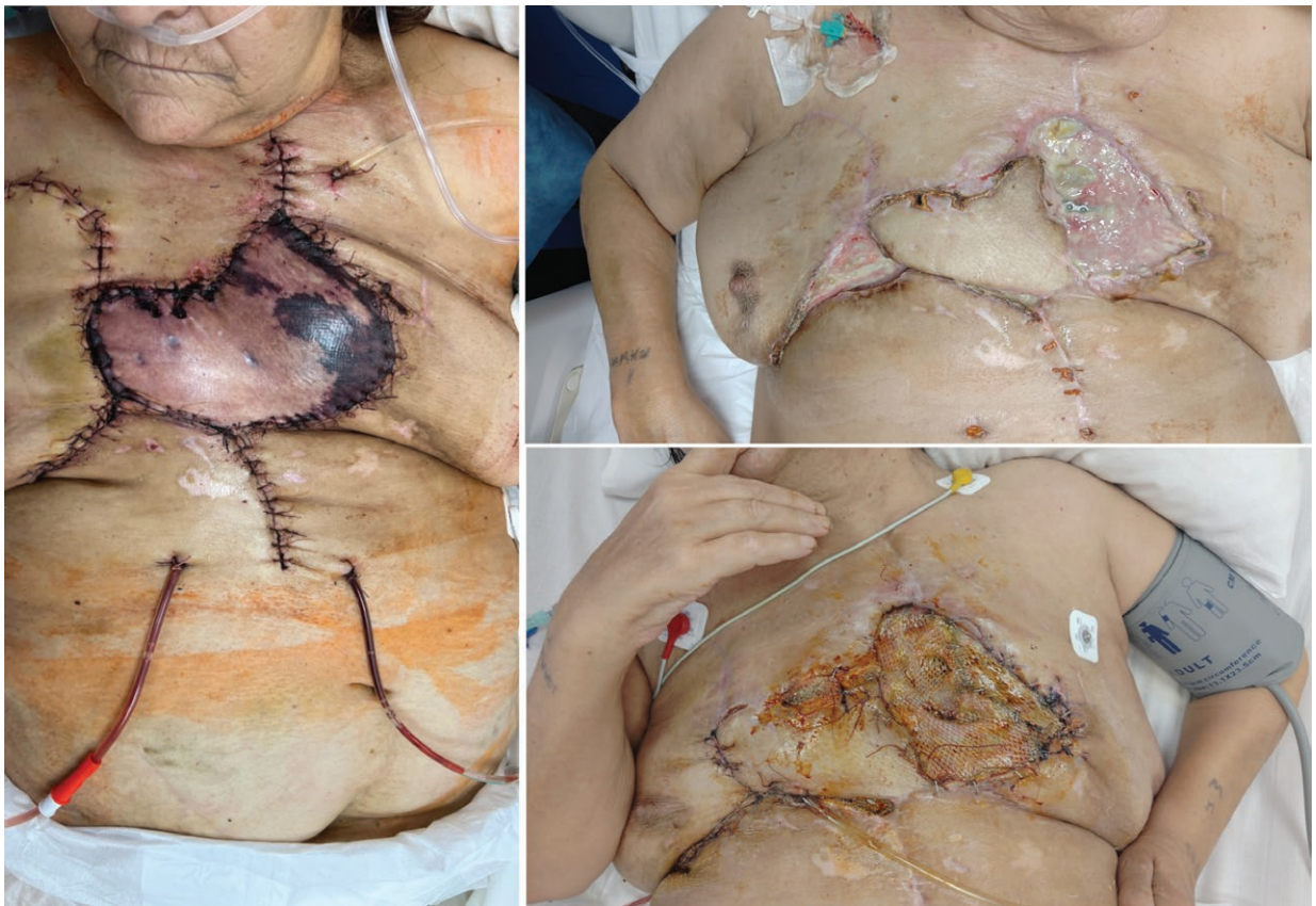
Figure 5. Clinical case 2: continued.