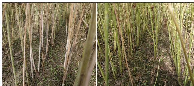
Fig 1. Unprotected (to the left) by fungicides and protected (to the right) plants of oilseed rape in 2014.

The protective programs significantly affected the occurrence of pathogens on the crop (Table 4). All effectively limited the disease symptoms (Table 5). Moreover, by affecting overwintering of plants and 1000 seed weight significantly affected the yield (Table 6). The average yield of seeds from the plants subjected to protective programmes was significantly higher than that