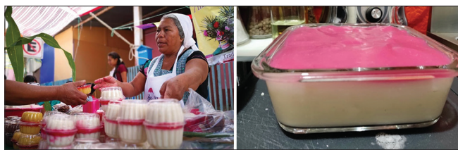
Fig 1. Per-Hispanic food "nicuatole".

During its pre-Hispanic production, it was poured into pots made from clay and grana cochineal was added to the final product to give it the characteristic red pigmentation (Islas, 2021). Its origin is so old that it goes back to the time of the Aztecs, where after a battle this food was offered as a reward to recover energy (Sigala, 2021). The objective of the present work was to present preliminary results of the physicochemical and proximate properties of the pre-Hispanic food locally known as "nicuatole".