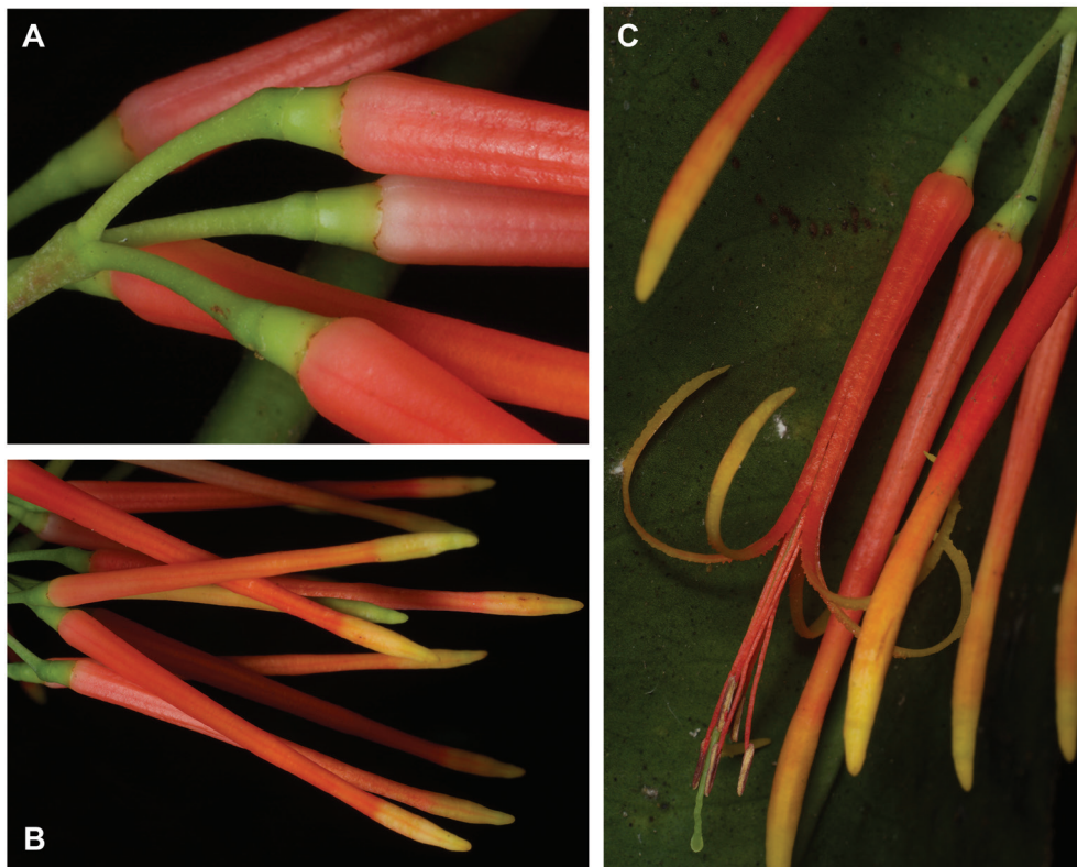
Figure 2. Psittacanthus job-kuijtii . A. Triad of an inflorescence showing basal floral parts (flower pedicels and cupule with bract, ovary, calyculus, and proximal portion of petals). B. Flower buds. C. Flower at anthesis with recurved petals. Photographs from the holotype ( David et al. 6371, HUA) by Esteban Domínguez. Figure composition by Diego Zapata (HUA).

COLOMBIA – Antioquia • Amalfi, Vereda La Gloria, 35–37 km NE de Amalfi, en la vía Amalfi-Vetilla, sobre Melastomataceae; 7°05'N, 74°56'W; 950–1100 m; 9 Dec. 1989; fr.; Callejas et al. 9218; HUA [HUA69823], NY • Anorí, Valle del río Anorí, between Dos Bocas & Anorí,