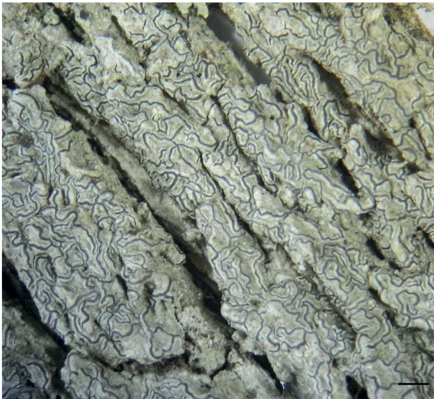
Figure 4 – Graphis glauconigra Vain., habitus. Scale bar = 1 mm