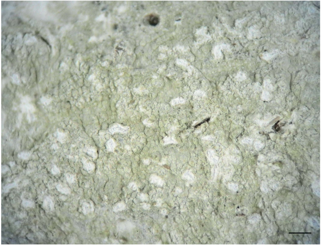
Figure 3 – Diorygma pruinatum (Eschw.) Kalb., Staiger & Elix, occurrence in Rio Grande do Sul. Scale bar = 1 mm.