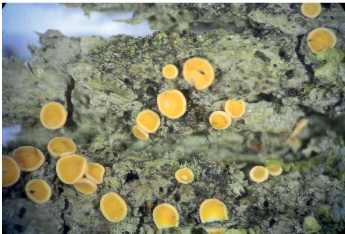
Figure 2 – Coenogonium nepalense (G.Thor & Vězda) Lücking, Aptroot & Sipman, occurrence in Southern Brazil. Scale bar = 1 mm.