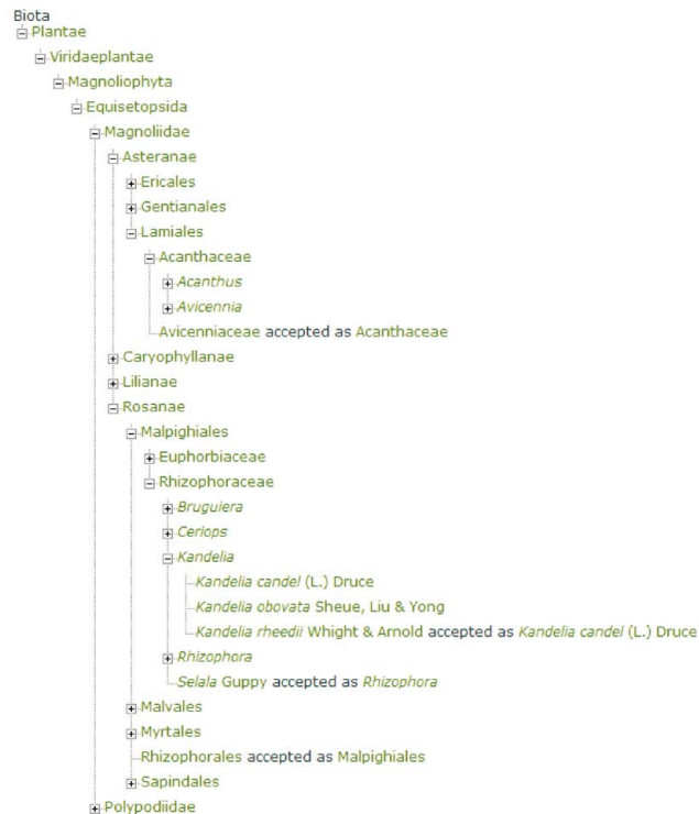
Figure 2 – A, screenshots of the search window; B, the expandable taxonomic tree of the MRDH.