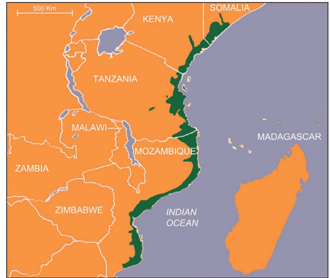
Figure 1 – Area with coastal forests in Eastern Africa (adapted from Burgess et al. 2004b).

More recently, on the basis of species richness and composition, Clarke (1998) has split White's Zanzibar–Inhambane