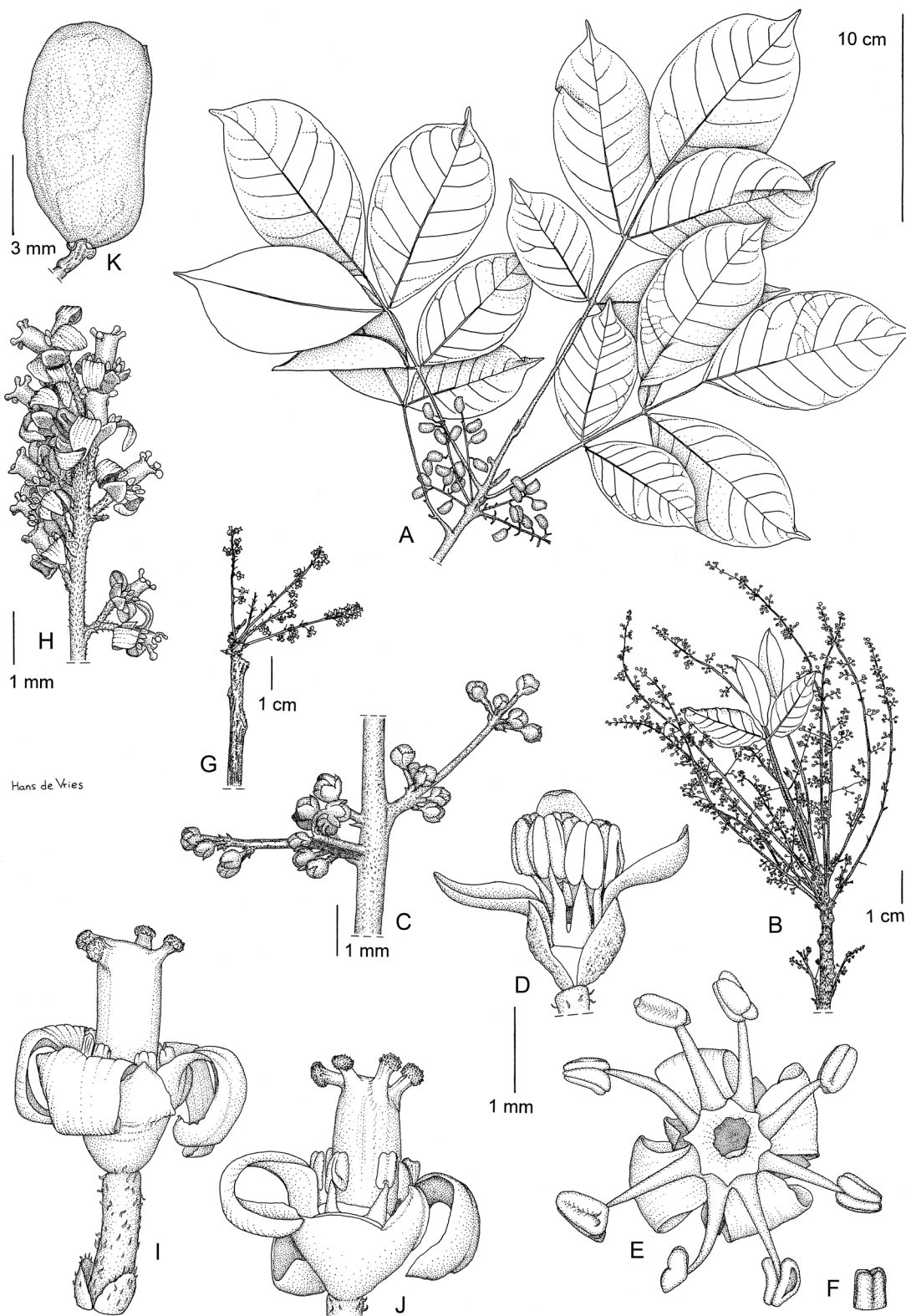
Figure 1 – Lanea glabrescens : A, fruiting branchlet; B, male flowering branchlet; C, detail of male inflorescence; D, male flower, one sepal and petal removed; E, male flower from above; F, pistillode; G, branchlet with female inflorescences; H, part of female inflorescence; I, female flower; J, female flower, one sepal and one petal removed; K, fruit. A & K from Harris et al. 8532 (WAG); B–F from Reitsma c.s. & Louis 1804 (WAG); G–J from Reitsma c.s. 1302 (WAG). Drawn by H. de Vries. © Botanic Garden Meise, reproduced from Breteler (2017: 11, pl. 4).