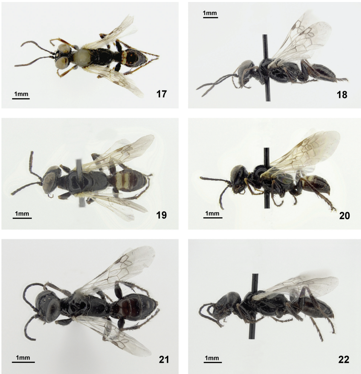
Figures 17–22. D. iranicum sp. nov.: 17. ♂ holotype dorsal view; 18. ♂ holotype lateral view; 19. ♂ paratype dorsal view; 20. ♂ paratype lateral view; 21. ♀ paratype dorsal view; 22. ♀ paratype lateral view.

Tataouine, 11.04.2001, M. Halada, 1 ♀ (OLML). — UNITED ARAB EMIRATES. Jebel Hafit, 24.07'N, 55.75'E, 03.03.2011, van Harten, det. Schmid-Egger, 1 ♀ (CSE). — Liwa Oasis 5 km E Mezairaa, 23.12'N, 53.84'E, 09.01.2011, leg. et det. Schmid-Egger, 1 ♂ (CSE). — Sarhaj Desert Park, 25.17'N, 55.42'E, 22.11.2004, van Harten, det. Schmid-Egger, 1 ♀ (CSE). Wadi Madaq, 25.18'N, 56.07'E, 29.04.2009, van Harten, 1 ♀ (CSE).