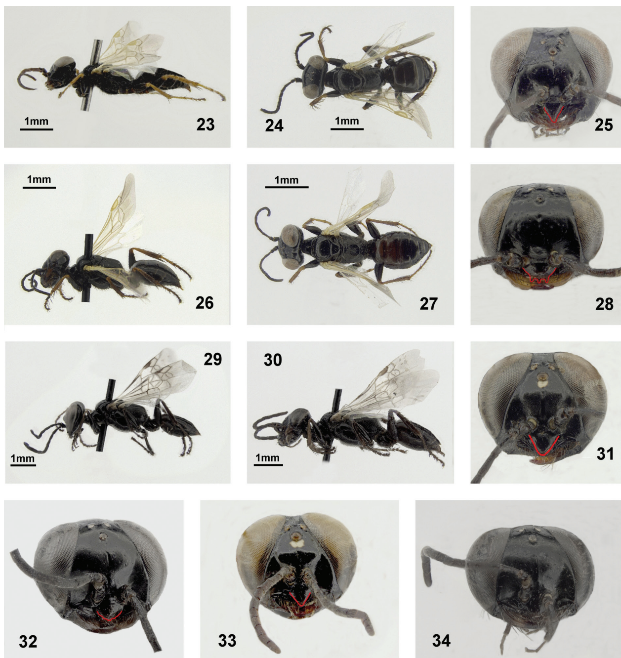
Figures 23–34. 23–28. D. palaearticum : 23. ♂ lateral view; 24. ♂ dorsal view; 25. ♂ head frontal view; 26. ♀ lateral view; 27. ♀ dorsal view; 28. ♀ head frontal view. 29–32. D. pulawskii : 29. ♂ lateral view; 30. ♀ lateral view; 31. ♂ head frontal view; 32. ♀ head frontal view. 33, 34. D. iranicum sp. nov. head frontal view: 33. ♂; 34. ♀.

brownish setae. Propodeal dorsum micro-reticulated, posterior margin smooth and shiny. Lateral surface of propodeum with strong punctures, interspaces distinctly micro-punctate. Declivity smooth and shiny, with scattered punctures. Propodeum, except propodeal dorsum, with pale setae. Metasomal terga with transverse micro-striation; sternum II with some erect pale setae. Ventral setae of fore and hind femur about half as long as maximal femur diameter. Forewing hyaline; tegula, basal sclerites and wing veins pale yellow; pterostigma pale yellow or pale brown with yellow border. Anterior margin of marginal cell about 0.7× as posterior height (Fig. 4).