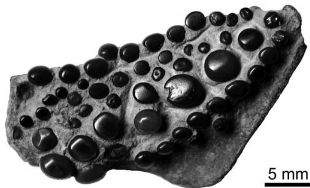
Figure 4. Isolated prearticular dentition of Athrodon sp. (MB f. 1337) from the Argile de Dives inférieure, Kelloways Rock, Callovian of Les vaches noires near Dives sur-mer (Dépt. du Calvados), Normandie, France displaying the characteristic tooth form and tooth arrangements of the lower jaw.

The only other pycnodont with more than seven vomerine tooth rows is Nonaphalagodus trinitiensis from the Albian of Texas (Thurmond 1974). This taxon, however, differs readily from Athrodon in the closer and more regular arrangement of teeth, the more individualised principal tooth row, and the absence of the characteristic ornamentation.