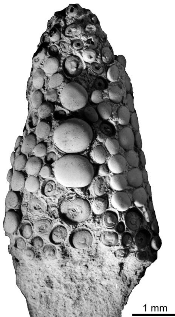
Figure 3. Isolated vomerine (upper) dentition of Athrodon wittei (Fricke, 1876) (MB f. 7135) from the Kimmeridgian of Tönjesberg near Hanover (NW) Germany.

clusal view. The largest main teeth occur in the middle portion of the dentition. The occlusal surface of all main teeth is completely smooth most probably due to their elevation compared to lateral teeth and thus being more exposed to grinding effects.