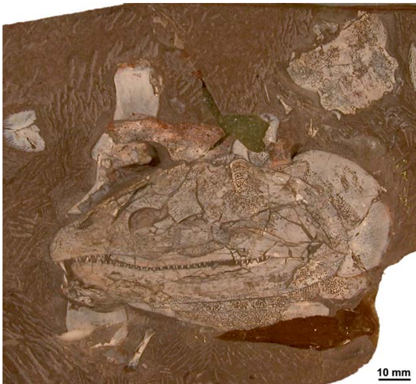
Figure 6. The tristichopterid rhipidistian n. gen. n. sp. (KUVP 94040); head in left lateral view under alcohol. Lower disparalis Zone, latest Givetian; Red Hill I, northern end of the Northern Simpson Park Range, northwest of Eureka, Nevada.

Besides the rare co-occurrence of abundant fish and conulariids, the co-occurrence of abundant fish and glass sponges is exceptional (Rigby & Mehl 1994; e.g. beds 10–12). Fishes, conulariids, and sponges show similar preservation in the Red Hill I Lagerstätte. All have been flattened; it is unusual that all conulariids from a locality are crushed to this extent. Crushing in some conulariid specimens evidently occurred follow-