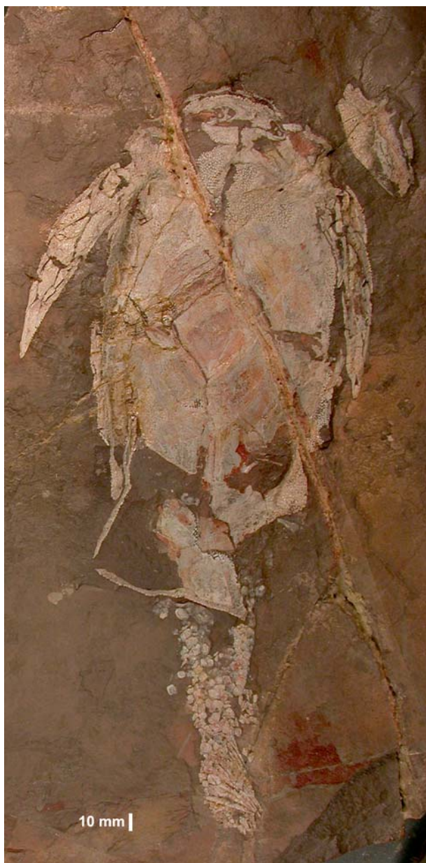
Figure 4. The antiarch placoderm Asterolepis sp. (KUV 80078A); ventral side. Lower disparalis Zone, latest Givetian; Red Hill I, northern end of the Northern Simpson Park Range, northwest of Eureka, Nevada.

The most common fish in the Red Hill I Lagerstätte (concentration Lagerstätte in the sense of Seilacher 1970) is the antiarch placoderm Asterolepis (Murphy et al. 1976), which occurs disarticulated throughout the section (J. W. Reed described single bones in his Ph.D. thesis 1979). Sometimes complete heads and/or armor, and separate tails of Asterolepis occur; one complete specimen with tail (Fig. 4) has been discovered. Os-