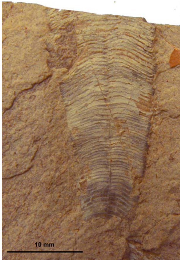
Figure 3. The conulariid Paraconularia recurvatus Babcock & Feldman, 1986a (KUMIP 314320). Lower disparilis Zone, latest Givetian; Red Hill I, northern end of the Northern Simpson Park Range, northwest of Eureka, Nevada.