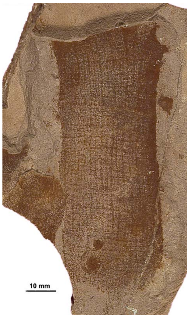
Figure 2. Holotype of the sponge Cyathophycella minuta Rigby & Mehl, 1994 (USNM 463531, compare Rigby & Mehl 1994, pl. 4, fig. 11). Lower disparalis Zone, latest Givetian; Red Hill I, northern end of the Northern Simpson Park Range, northwest of Eureka, Nevada.