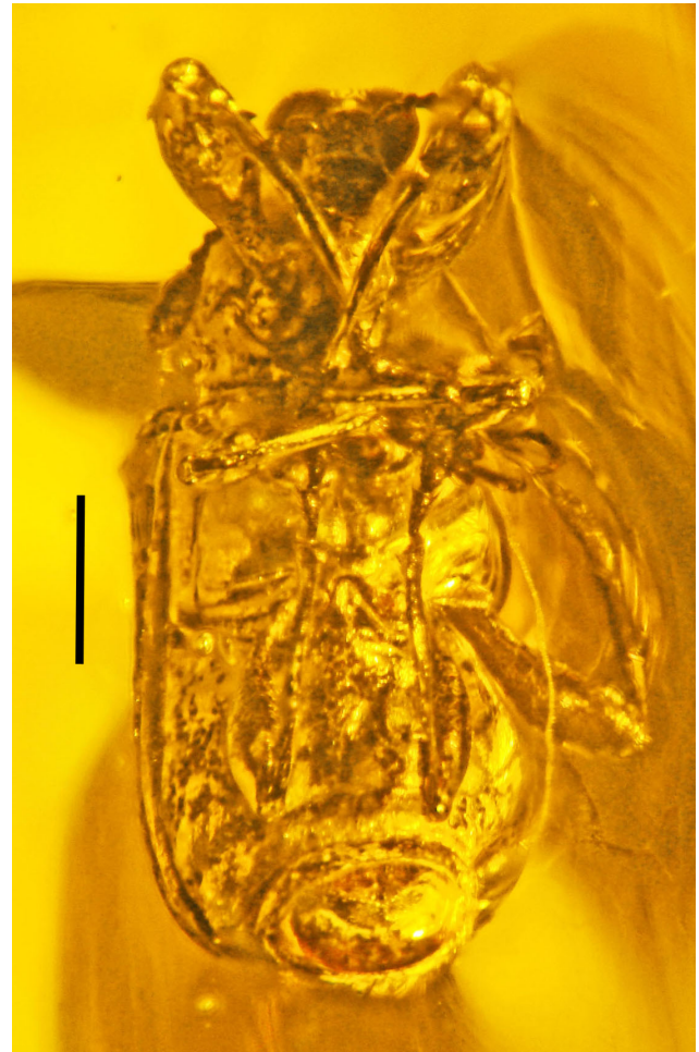
Figure 4. Ventral view of Pseudopilolabus othnius sp. nov. in Dominican amber. Bar: 0.7 mm.

Elytra: with scutellar striae; elongated and weakly convex, 1.4 times longer than wide at base and in middle, 1.8 times longer than wide at apical fourth, 2.6 times as long as pronotum; greatest width at humeri and middle, elytral base 1.4 times as wide as pronotal basal width; humeri weakly convex; punctate striae regular; intervals weakly flattened, almost smooth and wide, 1.3–2.0 times as wide as striae; apex of elytra rounded.