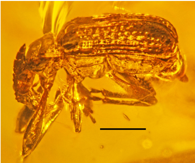
Figure 3. Lateral view of Pseudopilolabus othnius sp. nov. in Dominican amber. Bar: 1.0 mm.