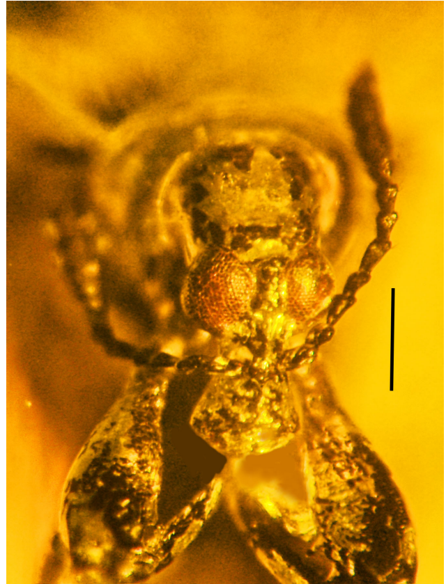
Figure 2. “En face” view of Pseudopilolabus othnius sp. nov. in Dominican amber. Bar: 0.4 mm.

Diagnosis: The new species is close to the extant P. viridanus (Gyllenhal, 1839) and P. splendens (Gyllenhal, 1839) from Mexico, but differs by having a bronzed body, narrower and more convex elytral intervals, long antennae reaching the middle of the pronotum, and weakly convex eyes; from