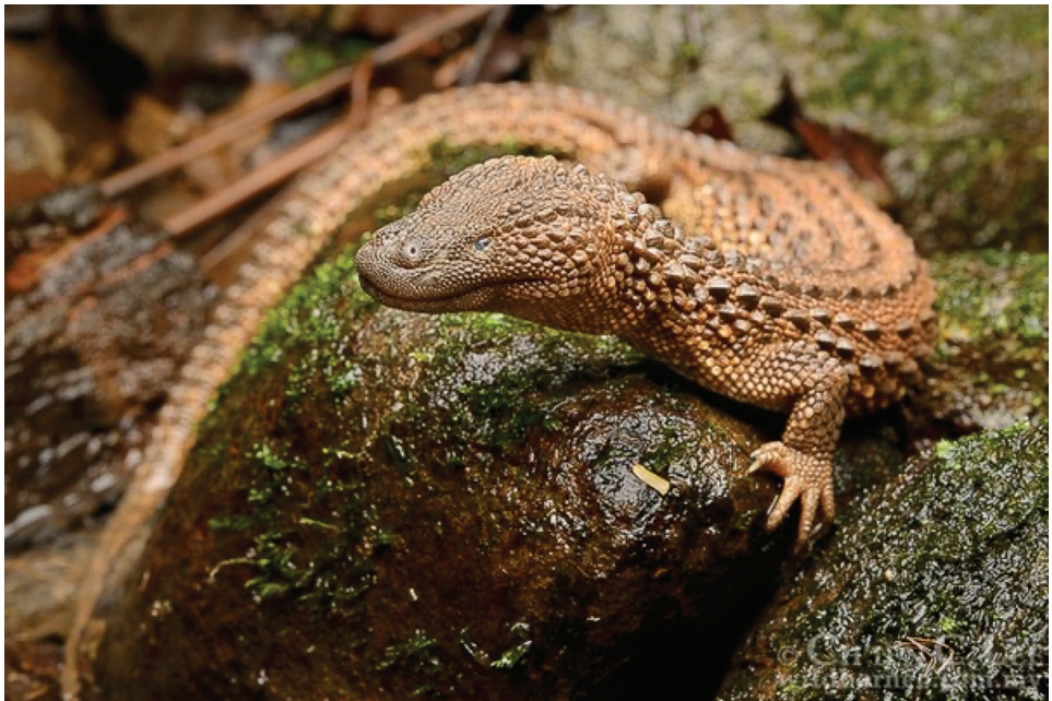
Figure 1. Borneo earless monitor lizards ( Lanthanotus borneensis ) in European zoos (cumulative number of individuals; continuous line) and price development in Europe (asking price for a single individual, in € corrected for inflation to 2020 prices; red circles). Note the logarithmic scale for prices.