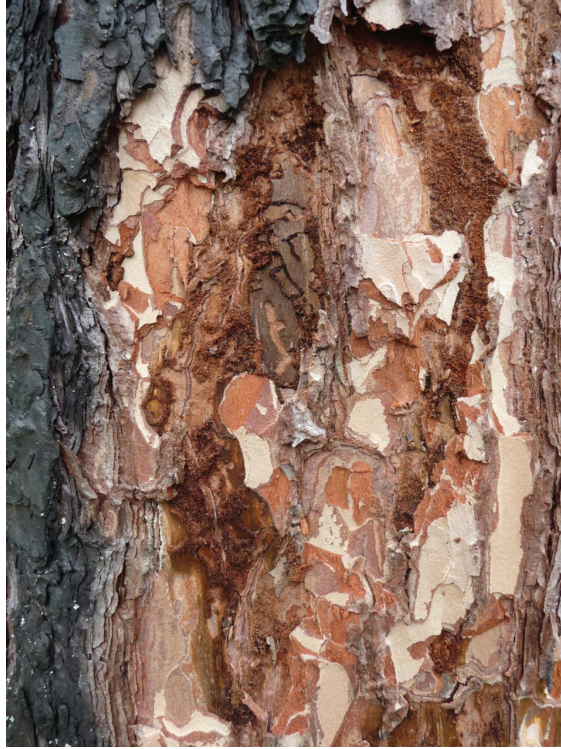
Figure 4. Larval galleries of Stephanopachys linearis in the Scots pine bark.