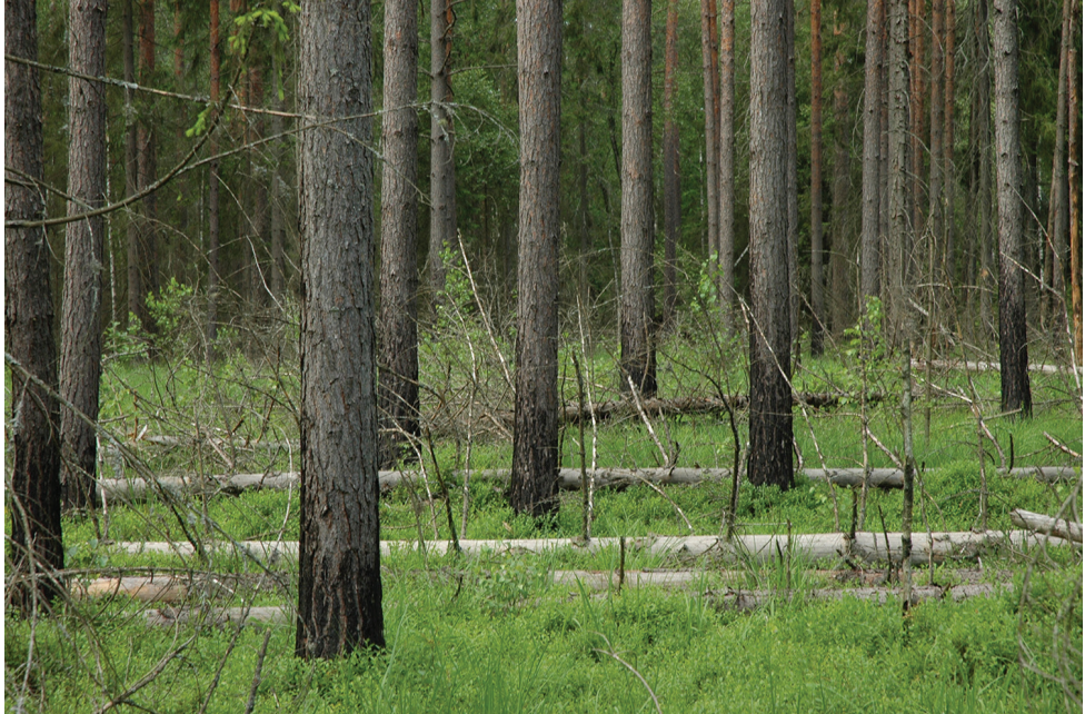
Figure 2. Scots pines burned by fire – host trees of Stephanopachys linearis (photo by J.M. Gutowski, 2017).