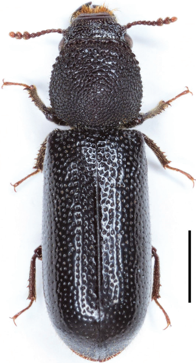
Figure 1. Stephanopachys linearis ; the specimen collected in Białowieża Primeval Forest in 2015 – dorsal view. Scale bar = 1 mm.

Also in 2017, black, baited funnel traps were suspended near the place where S. linearis had been previously collected and, in one of them one more specimen (22.05.–5.06.2017) and remnants of another one (20.06.–3.07.2017) were found.