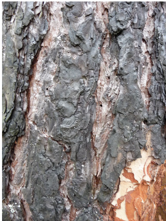
Figure 3. Imago outlets of Stephanopachys linearis (photo by J. Borowski, 2017).